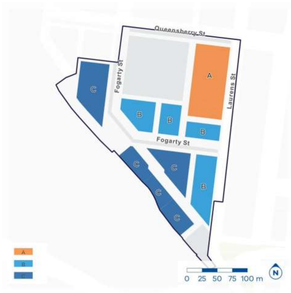
Map 1: Building Height and Floor Area Ratio