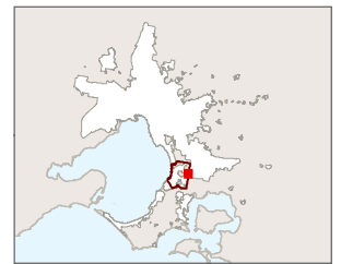
Part of Planning Scheme Map 6SCO

Disclaimer This publication may be of assistance to you but the State of Victoria and its employees do not guarantee that the publication is without flaw of any kind or is wholly appropriate for your particular purposes and therefore disclaims all liability for any error, loss or other consequence which may arise from you relying on any information in this publication.