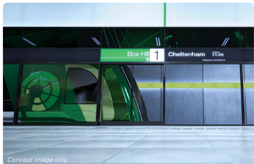
Concept image only

Suburban Rail Loop will give all Victorians greater access to reliable public transport and more choice in how they want to live and work.