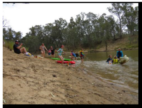
Goulburn River, Bunbartha, Dec 2018