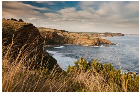
View from George Bass Coastal Walk

If you would like to be involved or hear updates about the project please register for updates online, or by phoning 13 19 63. You can also find out more by visiting www.engage.vic.gov.au/yallock-bulluk-marine-and-coastal-park-access-and-infrastructure-plan