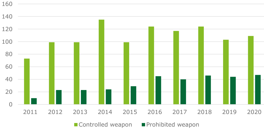
Chart 2.1 Use of prohibited and controlled weapons without an exemption or approval or excuse in Victoria, 2011-2020

the usage of weapons, without which harm may have occurred in these instances. To the extent that regulation and enforcement also creates a deterrent effect, in the absence of the current Regulations the use of prohibited and controlled weapons would likely have been at least marginally higher.