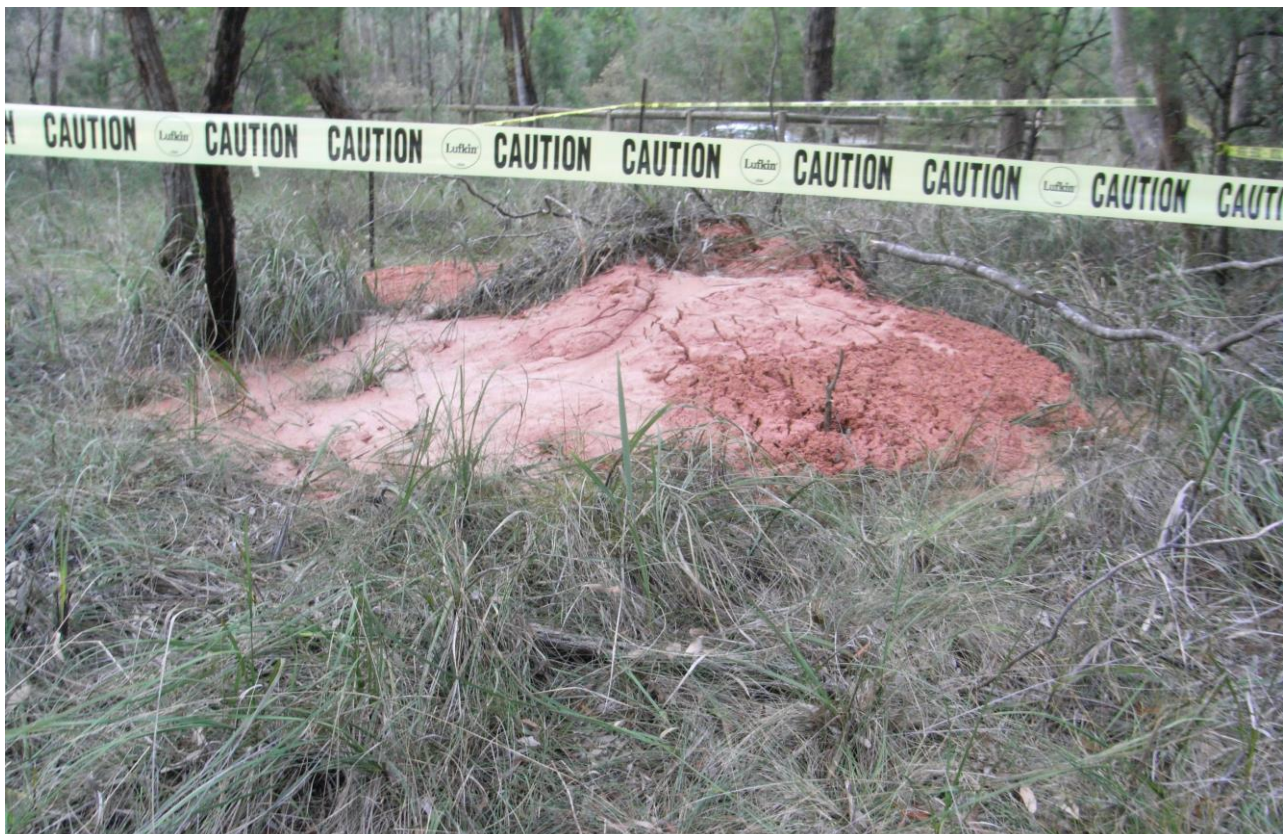
Frac-out of approx. 13 m 2 in Kilsyth South, showing mound.