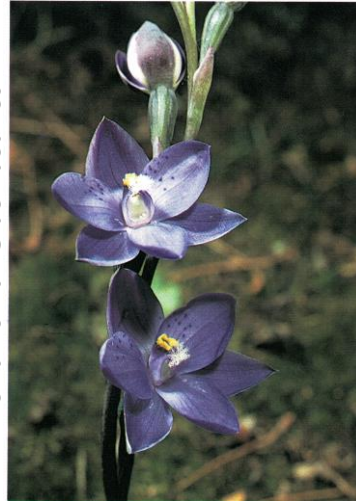
Crib Point.