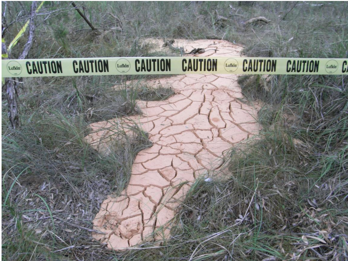
Frac-out of approx. 10 m 2 in Kilsyth South, within 1–3 m of a very rare orchid.