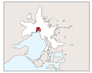
Part of Planning Scheme Map 4DCPO

Disclaimer This publication may be of assistance to you but the State of Victoria and its employees do not guarantee that the publication is without flaw of any kind or is wholly appropriate for your particular purposes and therefore disclaims all liability for any error, loss or other consequence which may arise from you relying on any information in this publication.