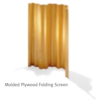
Molded Plywood Folding Screen