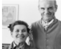
Charles and Ray Eames