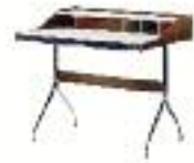
Nelson™ Swag Leg Desk