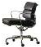
Eames Soft Pad Management Chair