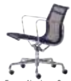
Eames Aluminum Group Management Chair