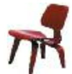
Eames Molded Plywood Lounge Chair