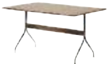
Nelson Swag Leg Work Table