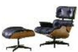
Eames Lounge Chair and Ottoman

The intervening years saw the lounge chair's introduction in 1956 on the "Today Show" and its transformation into a modern design icon, a lofty achievement for a chair that Charles hoped would simply have the "warm receptive look of a well-used first baseman's mitt."