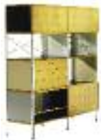
Eames® Storage Unit

We believe furniture becomes classic when it demonstrates a lasting appeal, an original personality, and a simple, innovative beauty and function. Classics are living proof that good things endure; they have a way of evoking a particular time and making time irrelevant. Committees and corporations don't design classics. Individuals like Charles Eames and George Nelson and Isamu Noguchi do. Their view of modern design lies at the heart of Herman Miller's collection of modern classics.