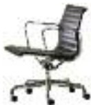
Eames Aluminum Group Management Chair

This device was their version of a curing oven. It let them create their own plywood and give it shape by using a bicycle pump to inflate a rubber membrane that pushed glued plies of wood against a curved, electrically heated plaster mold. The humble machine eventually allowed the Eameses to manufacture their molded plywood chair, named the Best Design of the 20th Century by Time magazine.