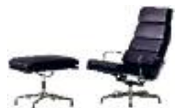
Eames Soft Pad Lounge Chair and Ottoman