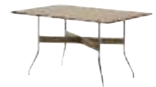
Nelson Swag Leg Table

The products above are among the original modern classics still manufactured today and available through Herman Miller.