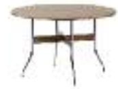
Nelson Swag Leg Table