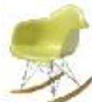
Eames Molded Plastic Armchair with Rocker Base