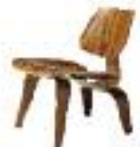
Eames Molded Plywood Lounge Chair