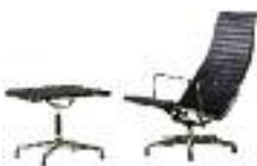
Eames Aluminum Group Lounge Chair and Ottoman