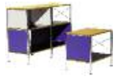
Eames Storage Units

The products above are among the original modern classics still manufactured today and available through Herman Miller.