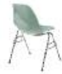
Eames Molded Plastic Side Chair

The products above are among the original modern classics still manufactured today and available through Herman Miller.