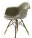
Sparrow Dowel Chair