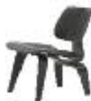
Eames Molded Plywood Lounge Chair