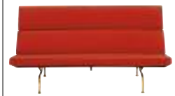
Eames Sofa Compact

The products above are among the original modern classics still manufactured today and available through Herman Miller.