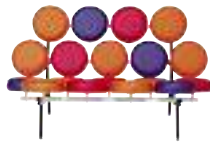
Nelson Marshmallow Sofa