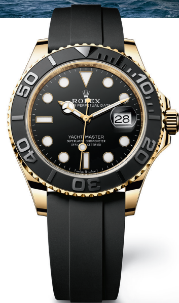
OYSTER PERPETUAL YACHT-MASTER 42