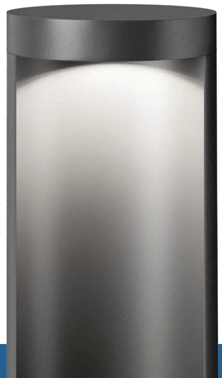
Bollards Coming soon

Our robust uplights come in a solid stainless steel finish, perfect for adding a high end, effortless look to your project.