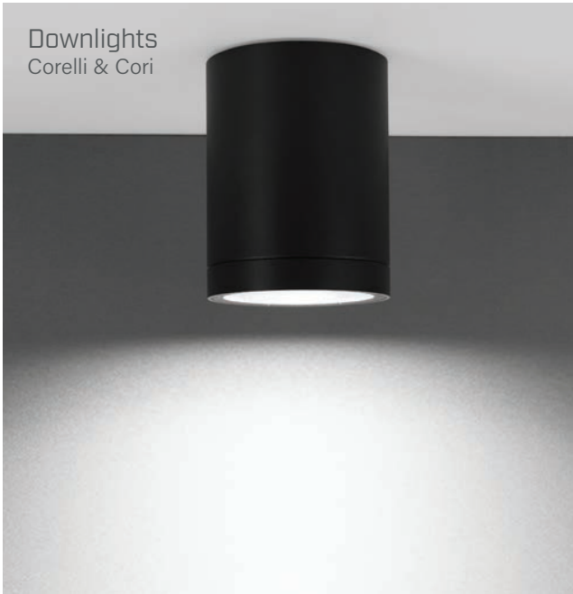
Our downlights have a comprehensive IP65 rating and are designed to make installation easy for different ceiling types. Our recessed downlights are available in three sizes, surface mounted downlights in two sizes including unique wall washer optics.