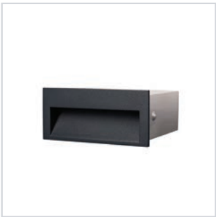
Our high quality recessed and surface mounted steplights come in a range of shapes and sizes.