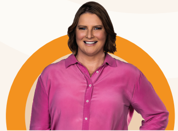
Leisel Jones OAM - Ambassador

It's also a fantastic opportunity to rally your team behind a shared cause, connect with the community, and have a great time doing it.