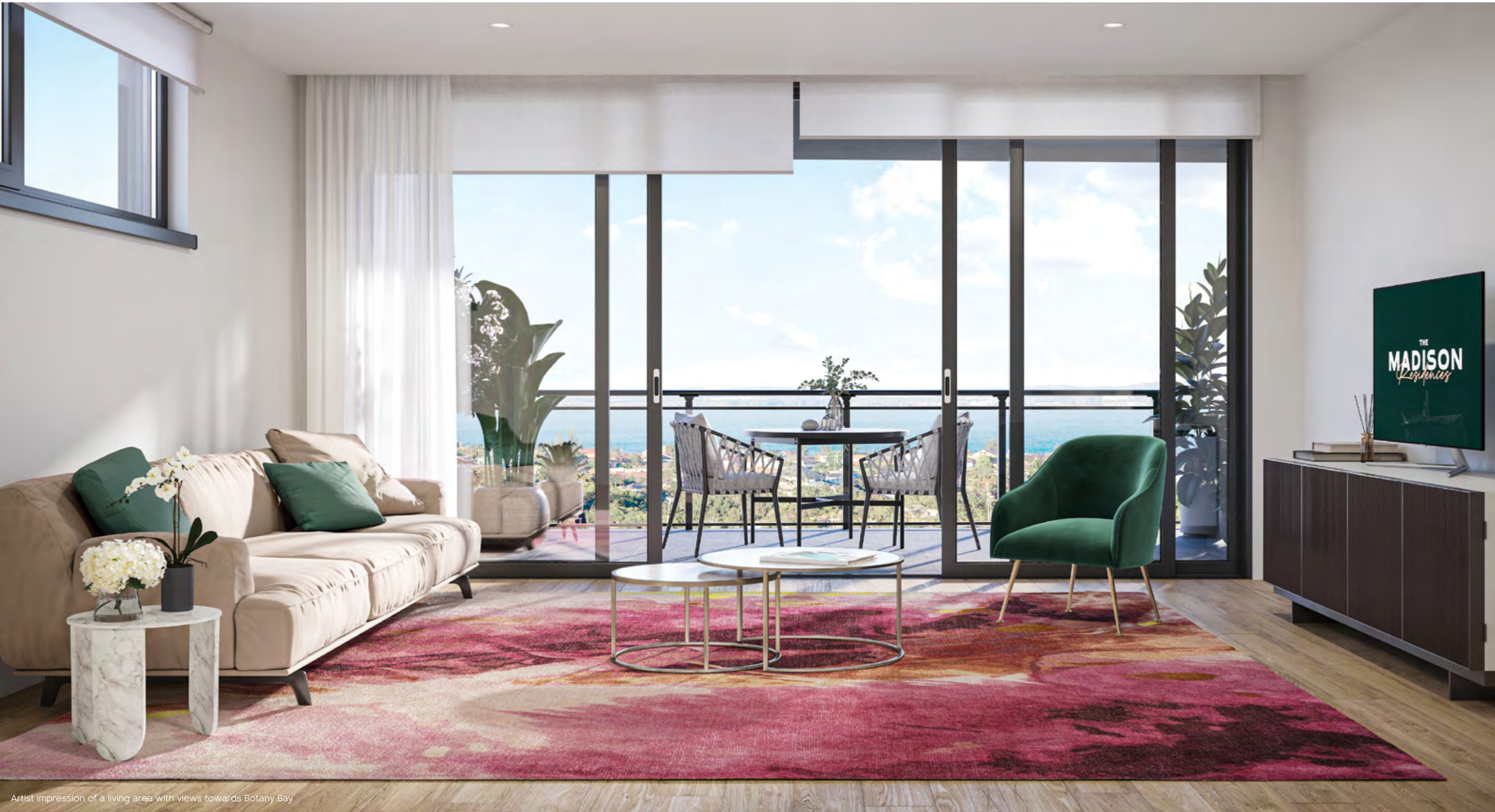
Artist impression of a living area with views towards Botany Bay

Open, inviting living spaces radiate natural light with floor-to-ceiling glass sliders that give seamless alfresco flow. Functionality and flow are heroes, with natural tones and intuitive spaces ready to make your own.