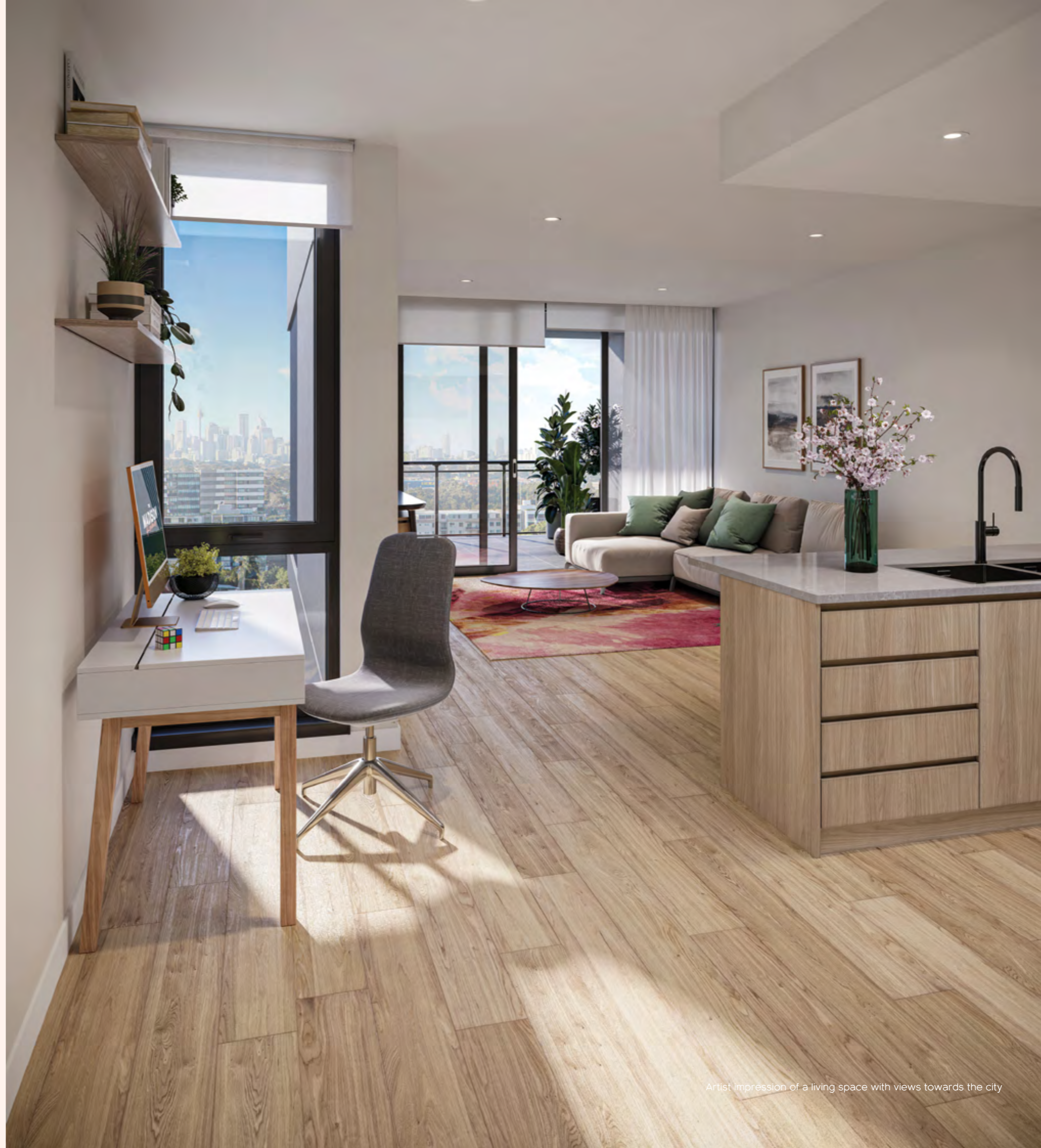
Artist impression of a living space with views towards the city