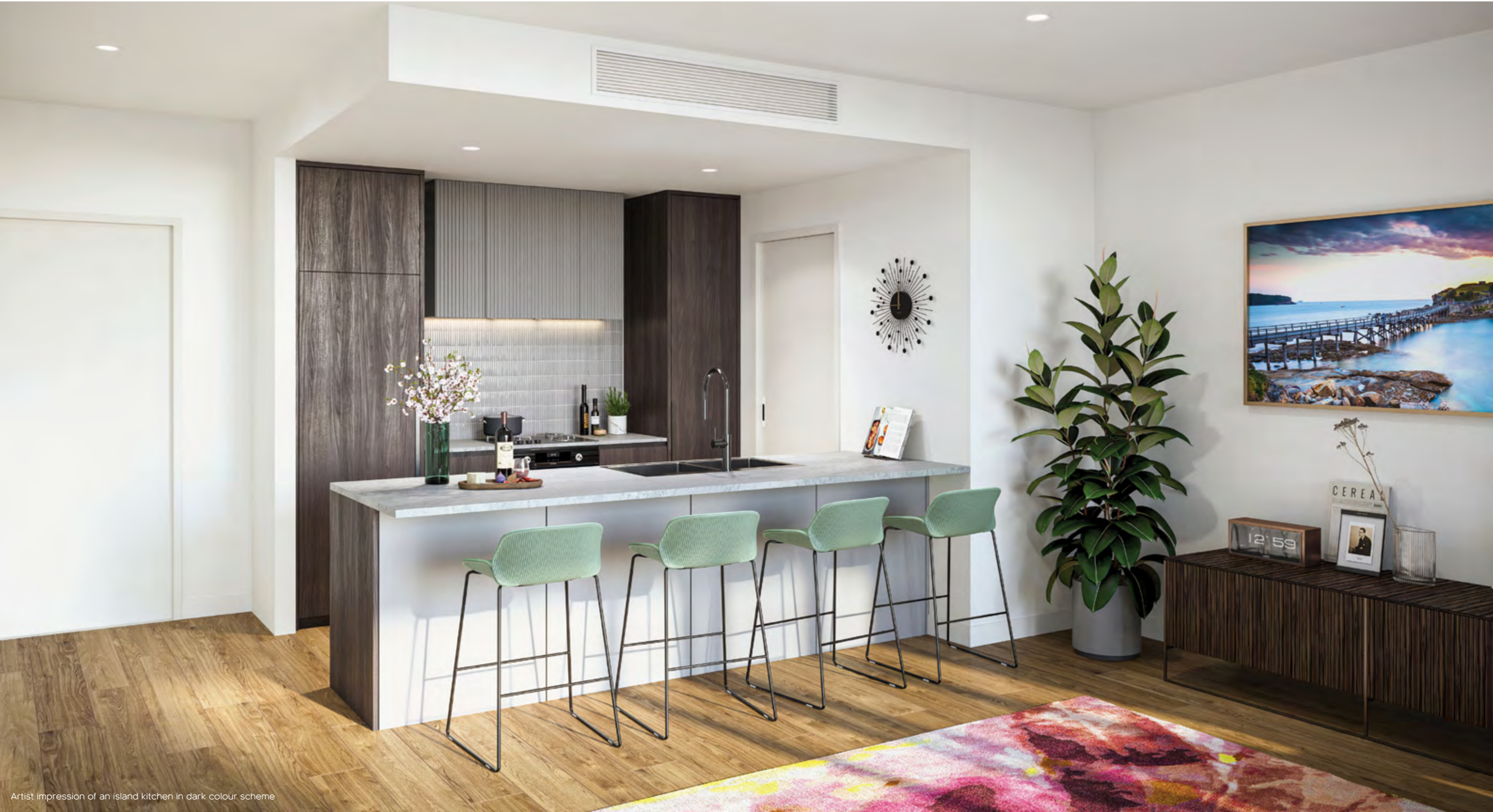
Artist impression of an island kitchen in dark colour scheme