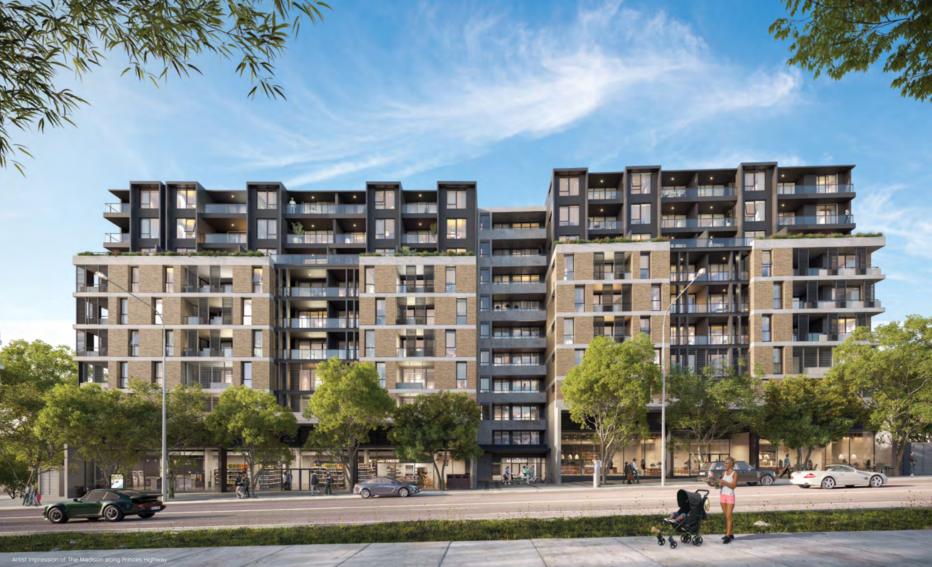
Artist impression of The Madison along Princes Highway

Glass balconies and privacy screens magnify the space in each apartment, giving you freedom to wander in and out or entertain in laidback style.