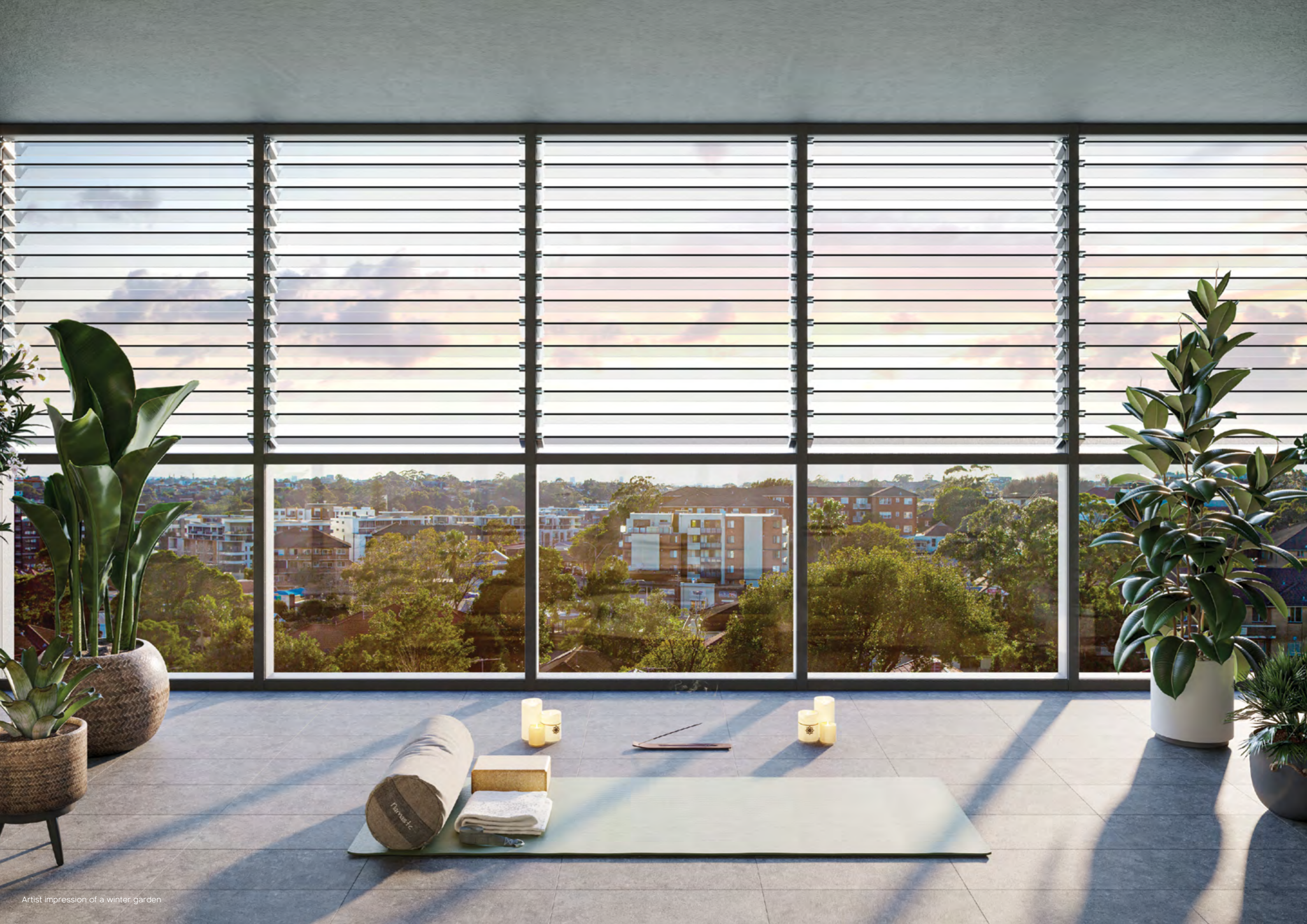
Artist impression of a winter garden