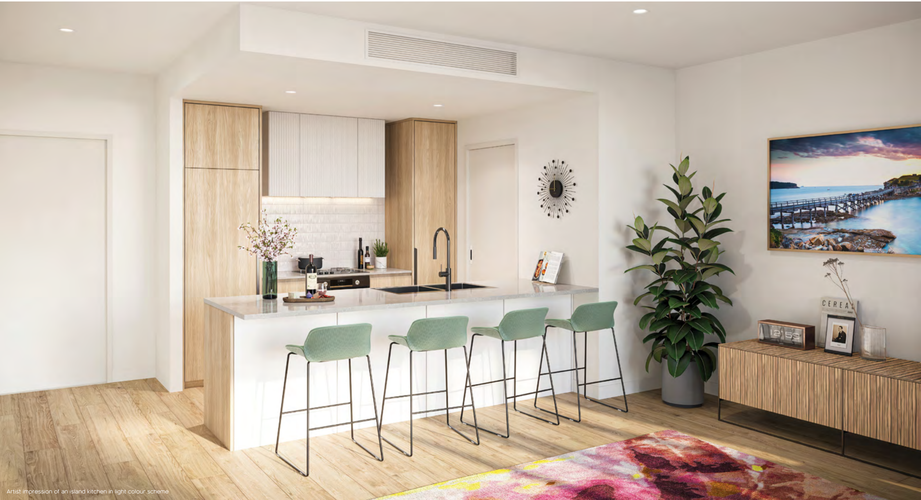
Artist impression of an island kitchen in light colour scheme

Refined yet practical, spacious yet compact. Stone benches top the kitchen, fitted out to cater for a quick bite or a milestone meal. A mosaic tile splashback, Parisi fixtures and polyurethane cupboards reflect its designer style.