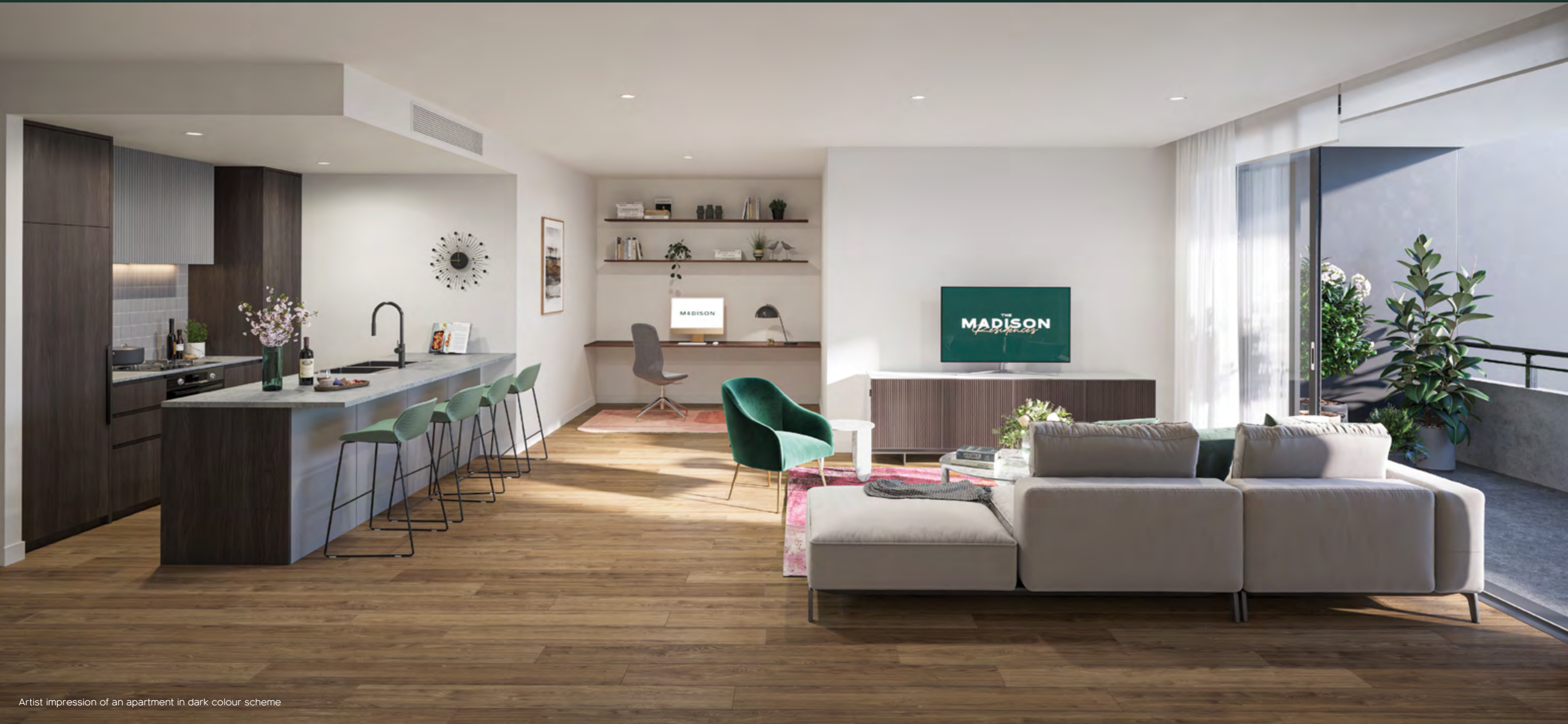
Artist impression of an apartment in dark colour scheme