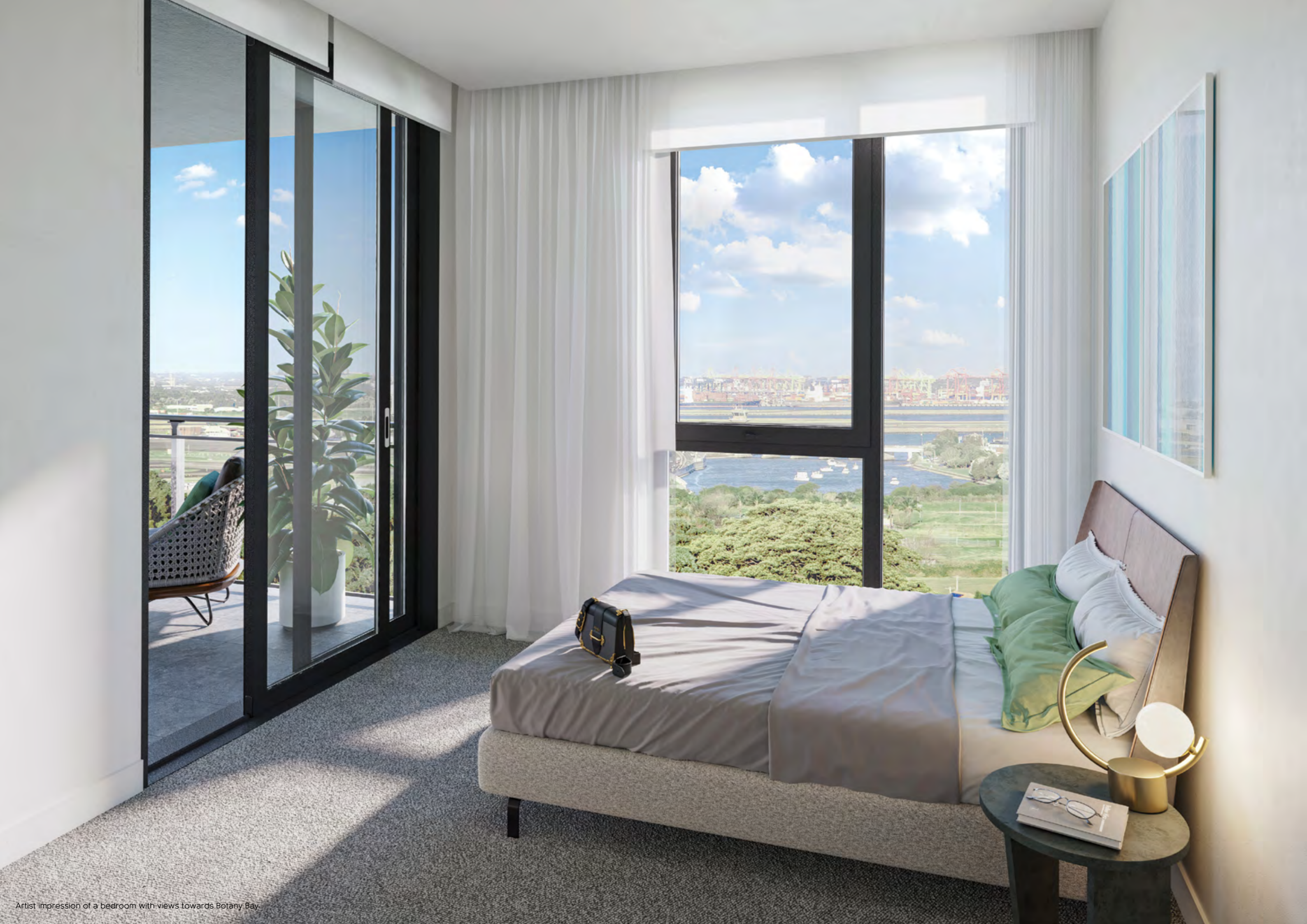
Artist impression of a bedroom with views towards Botany Bay