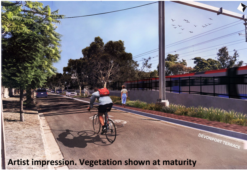
Artist impression. Vegetation shown at maturity