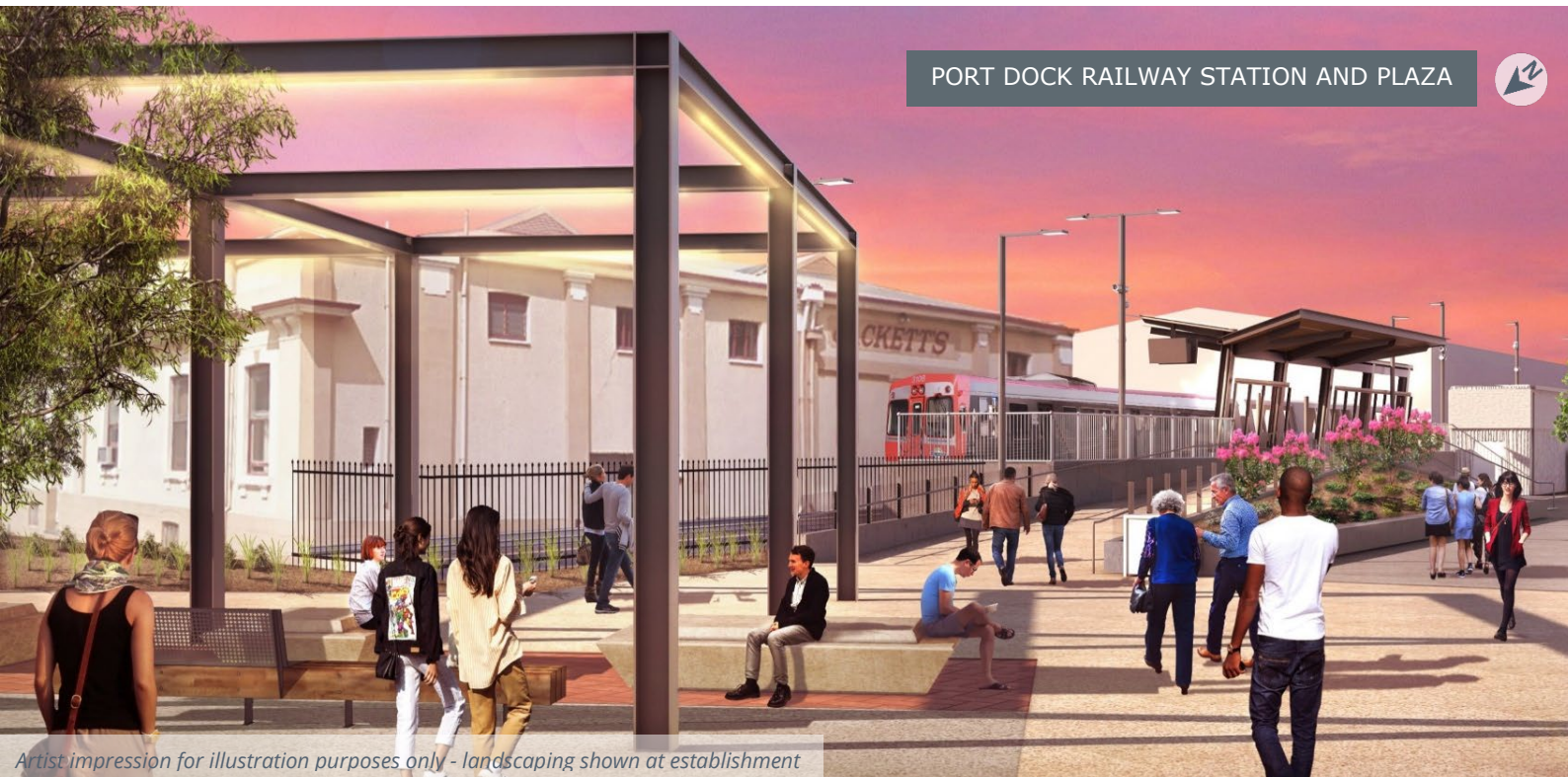
PORT DOCK RAILWAY STATION AND PLAZA