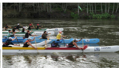
2013 Race Start