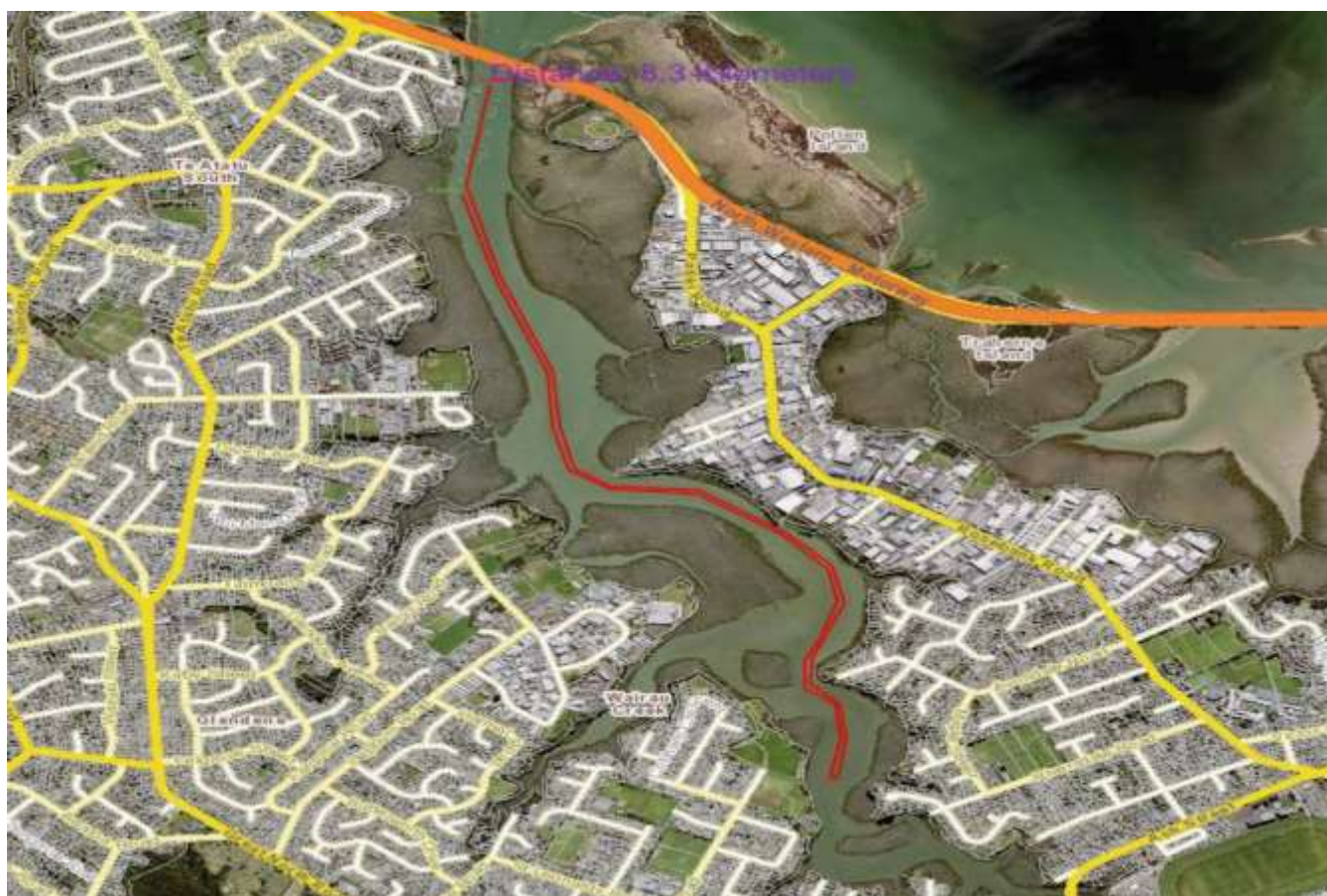
Bad Weather Course 8km (16km x 2 circuits)