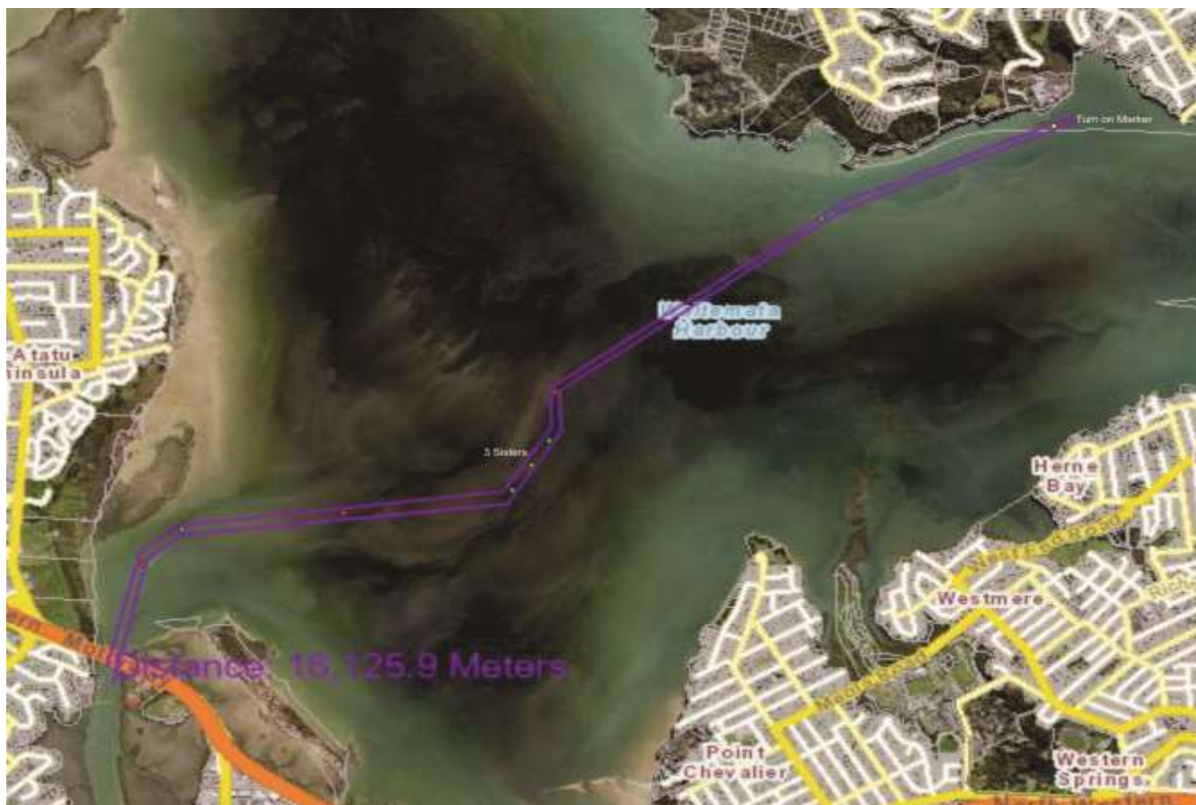
Long Course 16km