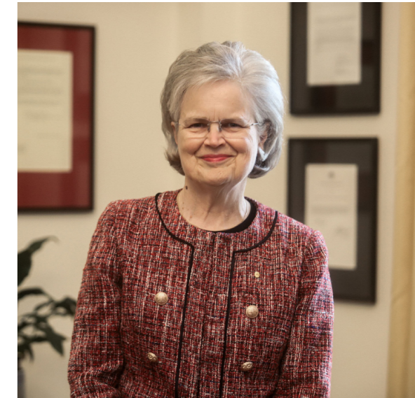
Her Excellency the Honourable Frances Adamson AC, Governor of South Australia

Your work strengthens the leadership capacity of our State and helps ensure South Australia is well positioned for the challenges and opportunities of the future.