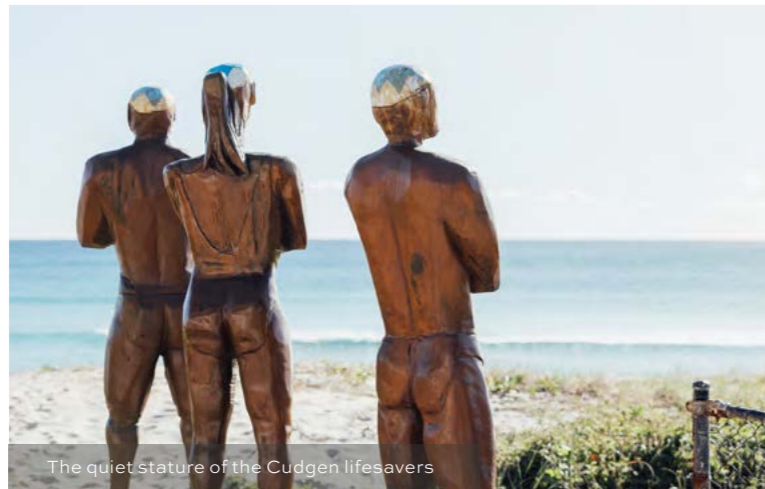
The quiet stature of the Cudgen lifesavers