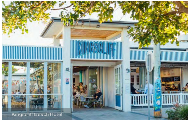
Kingscliff Beach Hotel