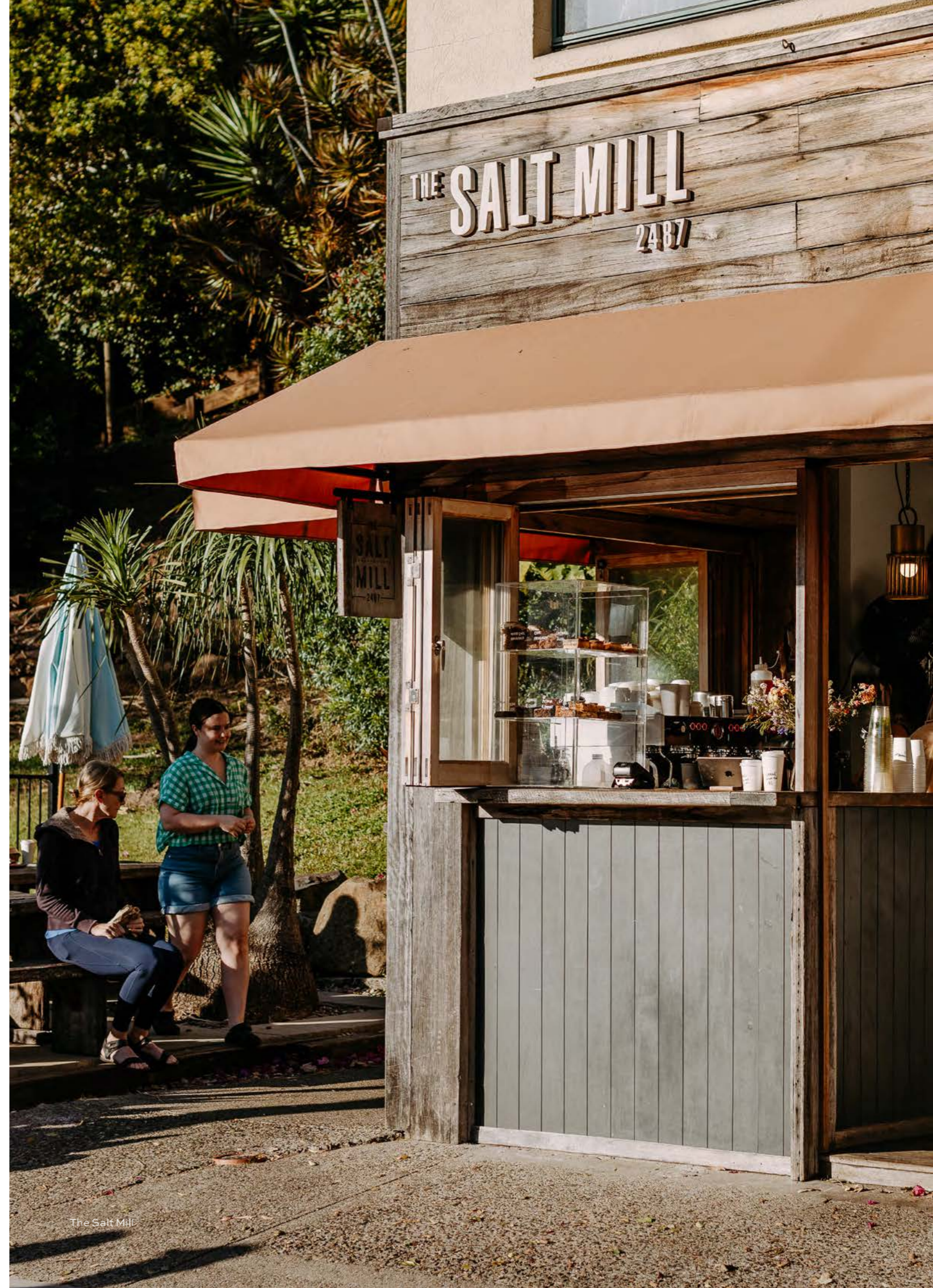
The Salt Mill

Ease into the distinctive, slightly bohemian charm of town. The aroma of fresh coffee drifts on the morning air, bustling kitchens and eclectic providers tempt the taste buds, and a variety of shops and services render Kingscliff an active, walkable locale. Lively, laid-back and coastal, it's a very easy community to call home.