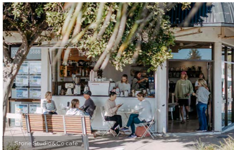
Stone Studio & Co cafe

Ease into the distinctive, slightly bohemian charm of town. The aroma of fresh coffee drifts on the morning air, bustling kitchens and eclectic providers tempt the taste buds, and a variety of shops and services render Kingscliff an active, walkable locale. Lively, laid-back and coastal, it's a very easy community to call home.