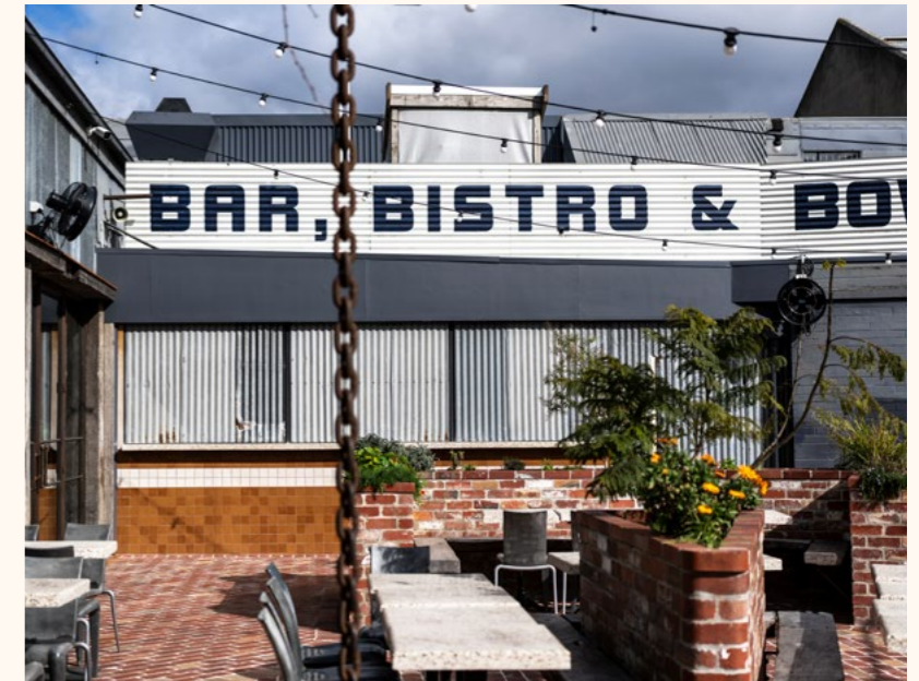
The Keys — 15min drive