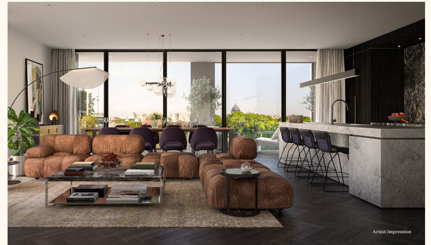
48 Dundee St