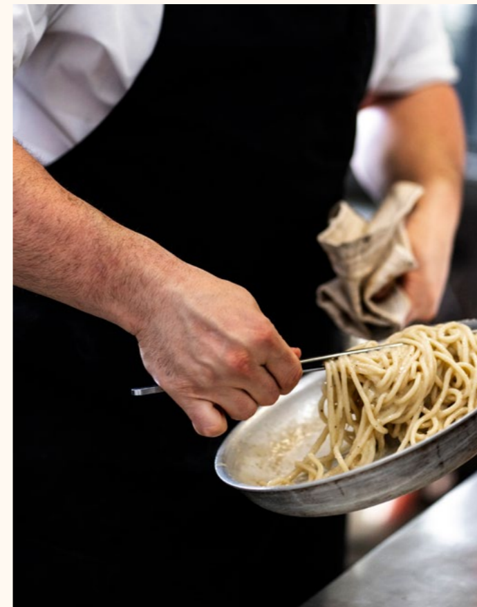
Pausa Pranzo — 15min drive