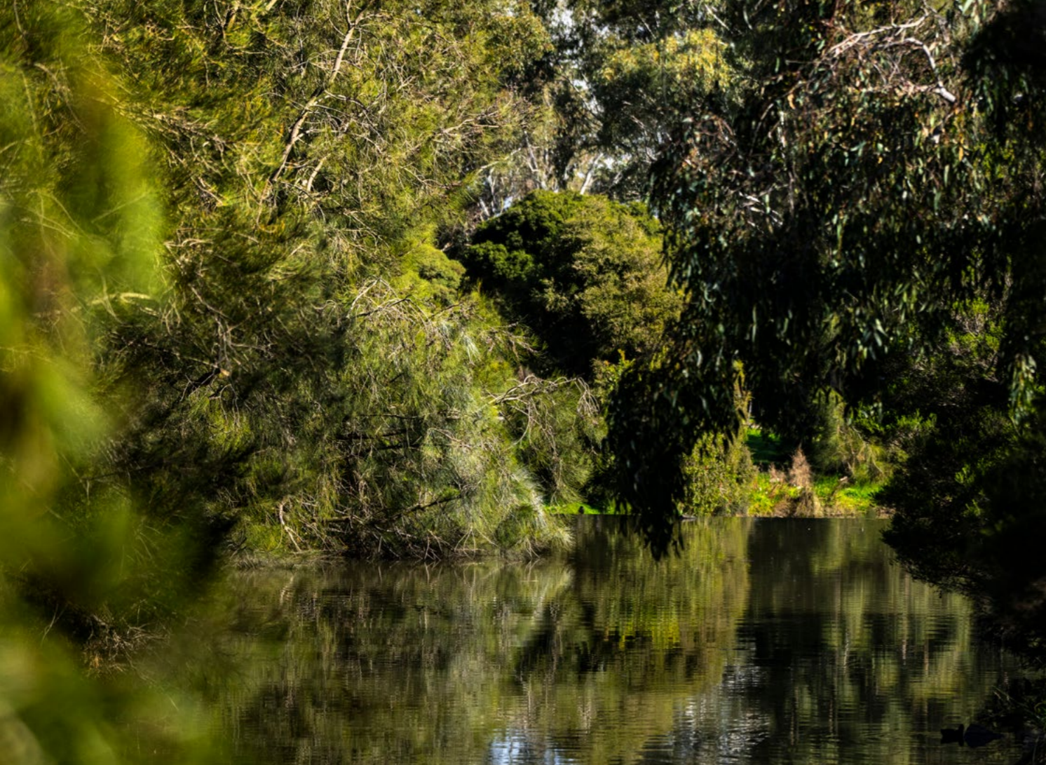
Edwardes Lake Park — 8min drive