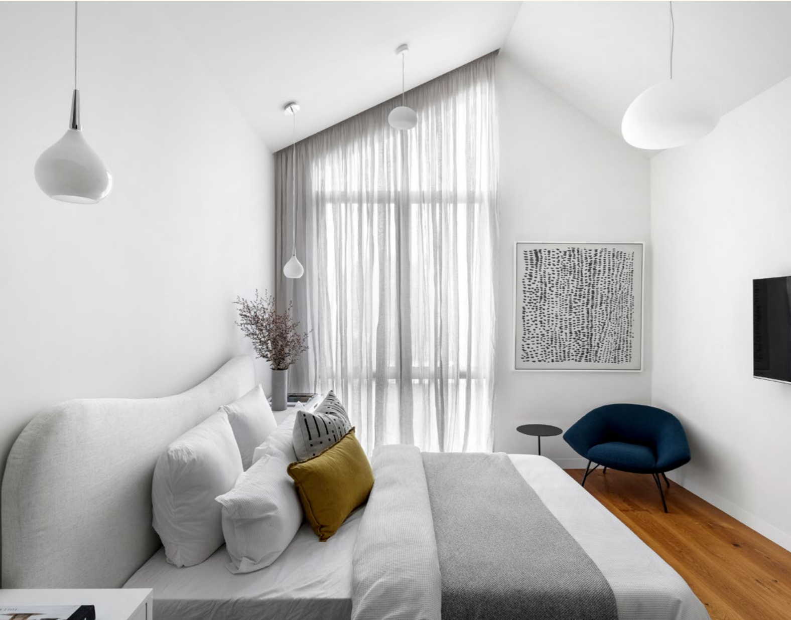
2 Little Newmarket Street, Northcote