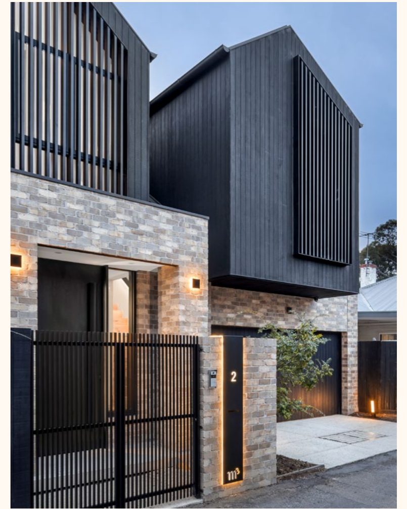
2 Little Newmarket Street, Northcote

Our multifaceted service is committed to high quality outcomes and nurturing long-term partnerships. We take pride in delivering to the exceptional standards we envision for all our projects. There is no compromise to liveable proportions, or the quality of our fixtures, fittings, and appliances. Nothing stock standard applies to anything we do, setting new benchmarks in every locale where our projects come to life.