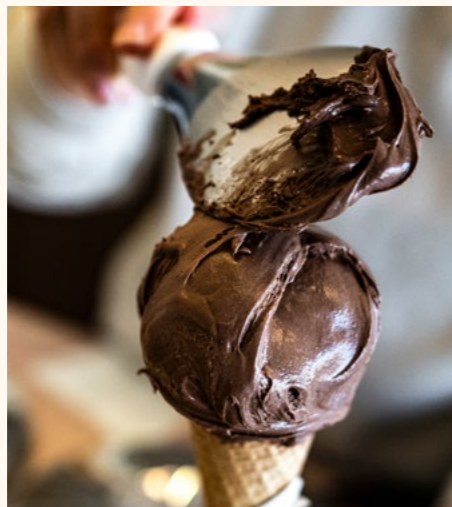
Cono Gelateria — 10min drive