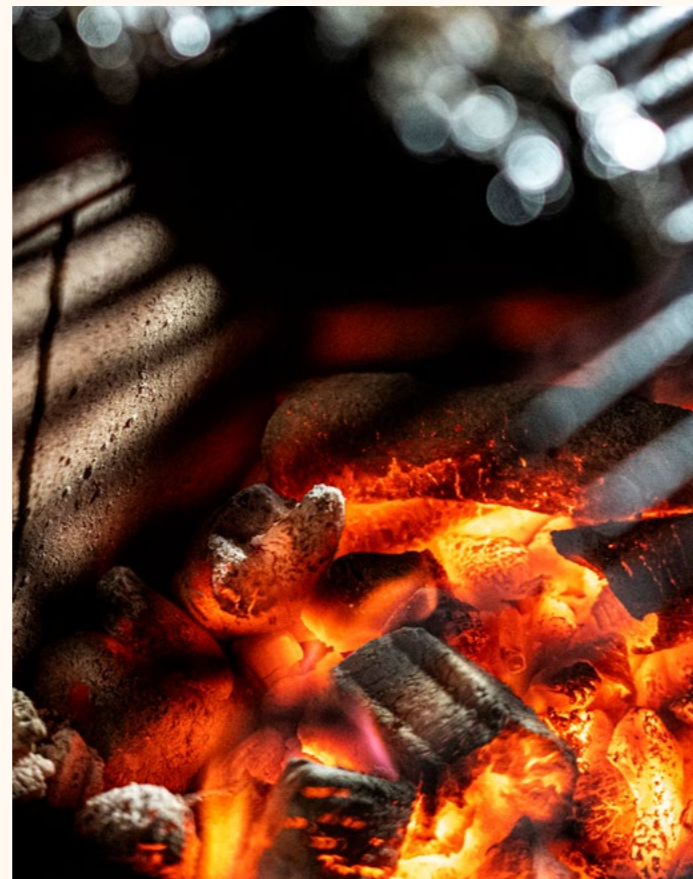
The Keys — 13min drive