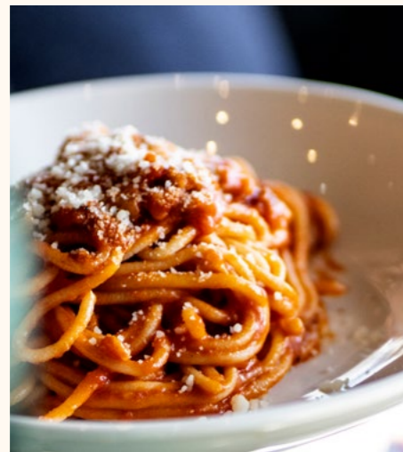
Pausa Pranzo — 12min drive