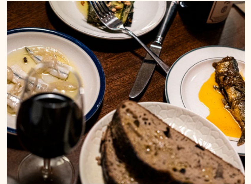
La Pinta — 6min drive