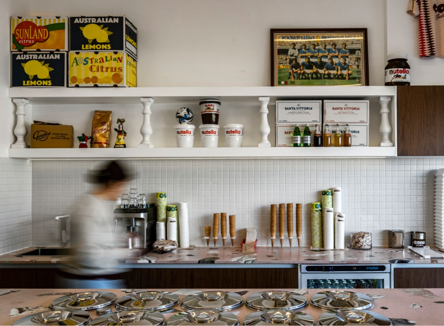
Cono Gelateria — 8min by car