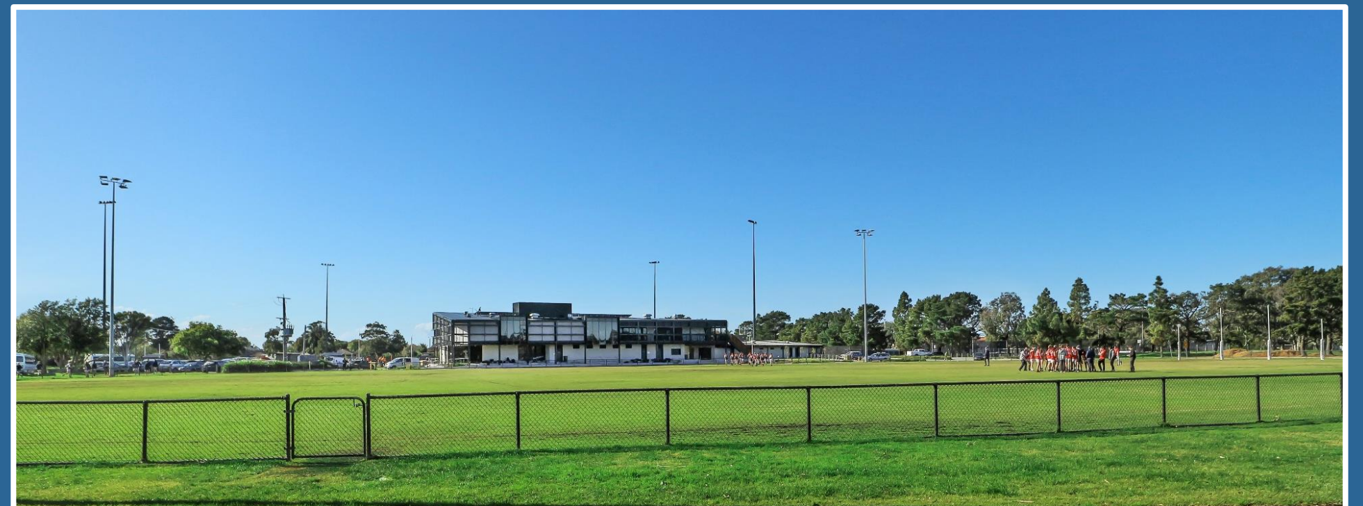
Roy Dore Reserve

Enjoy local experiences at the National Water Sports Centre or the Melbourne Cable Park, or catch a quiet moment at the local Patterson River Golf Club.