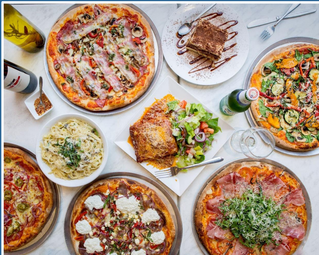
Mr Smoke Stack

Located only 500m away from the Carrum foreshore, Malia is in the heart of the action — with bustling cafes, shops, parks and the train all a short stroll from your door