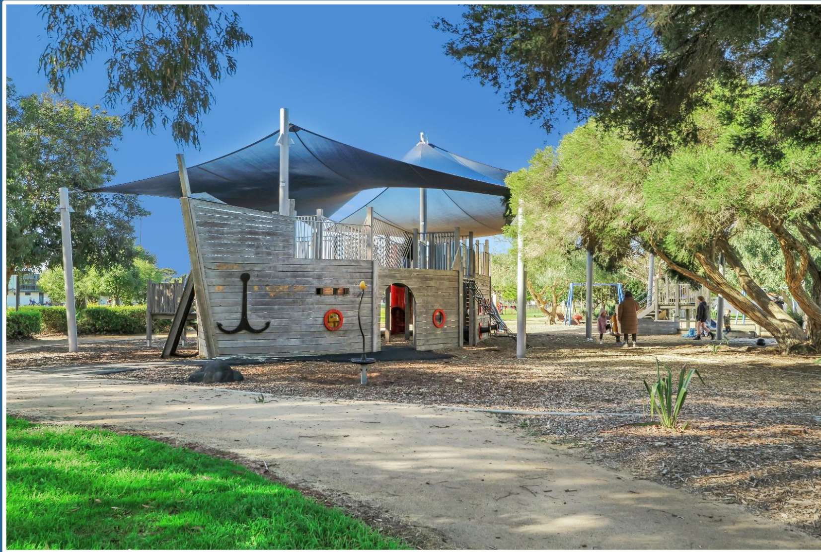
Roy Dore Playground