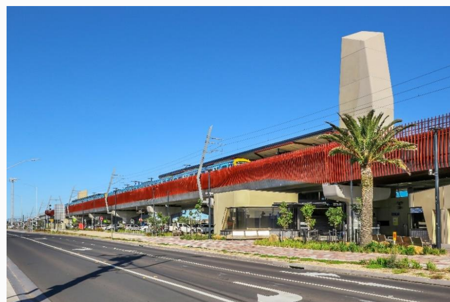
Carrum Train Station

Well serviced by multiple transport options, Carrum Train Station offers direct access to the CBD while buses are right at the doorstep.