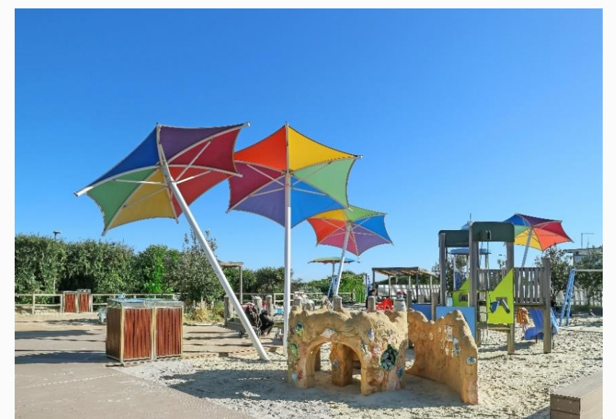
Carrum Foreshore Playground