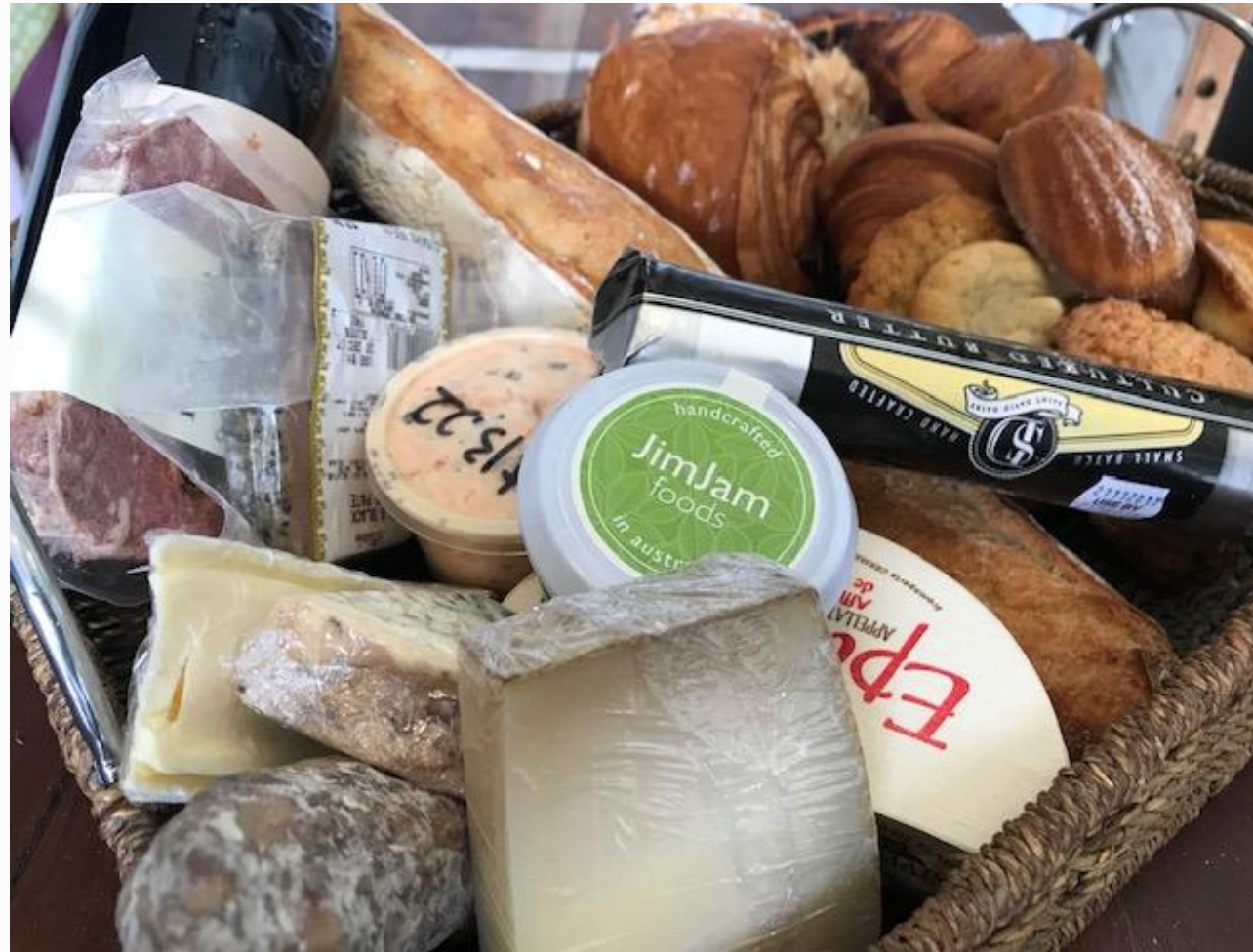
The Little French Deli