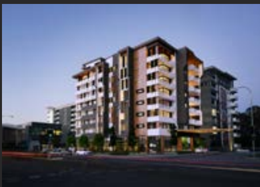
Estilo on Kittyhawk

Alongside an encompassed team of senior directors and passionate personnel, GVG is committed to providing the highest level of quality and personalised service. All projects are delivered at a high standard from our architecturally designed & lead team of in-house professionals, communicated through to our project management team adhering to strict regulations & delivering superior builds, passed through to the personalised service of the Gardner Vaughan sales & marketing team. We are with your journey every step of the way.