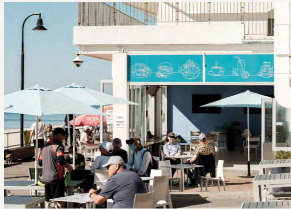
Brighton Le-Sands Cafés

Step outside and every lifestyle asset is within easy reach, from friendly village baristas to rapid urban connectivity