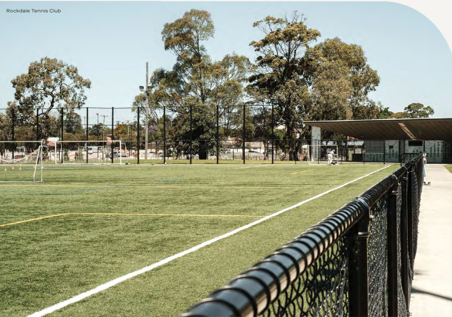
Rockdale Tennis Club