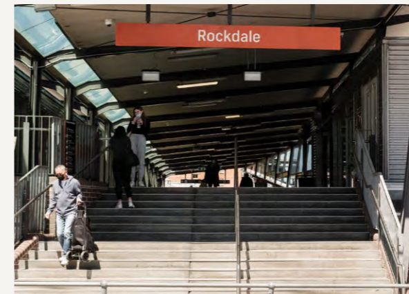
Rockdale Train Station