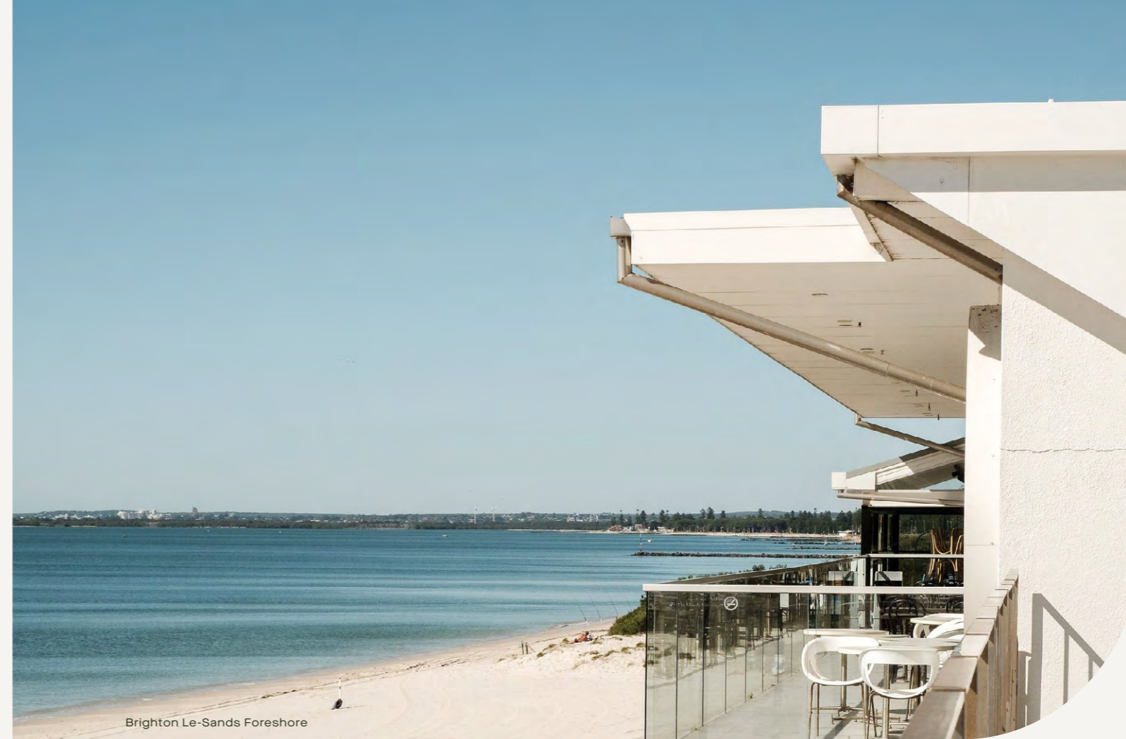
Brighton Le-Sands Foreshore