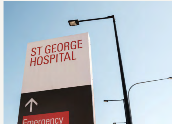
St George Hospital