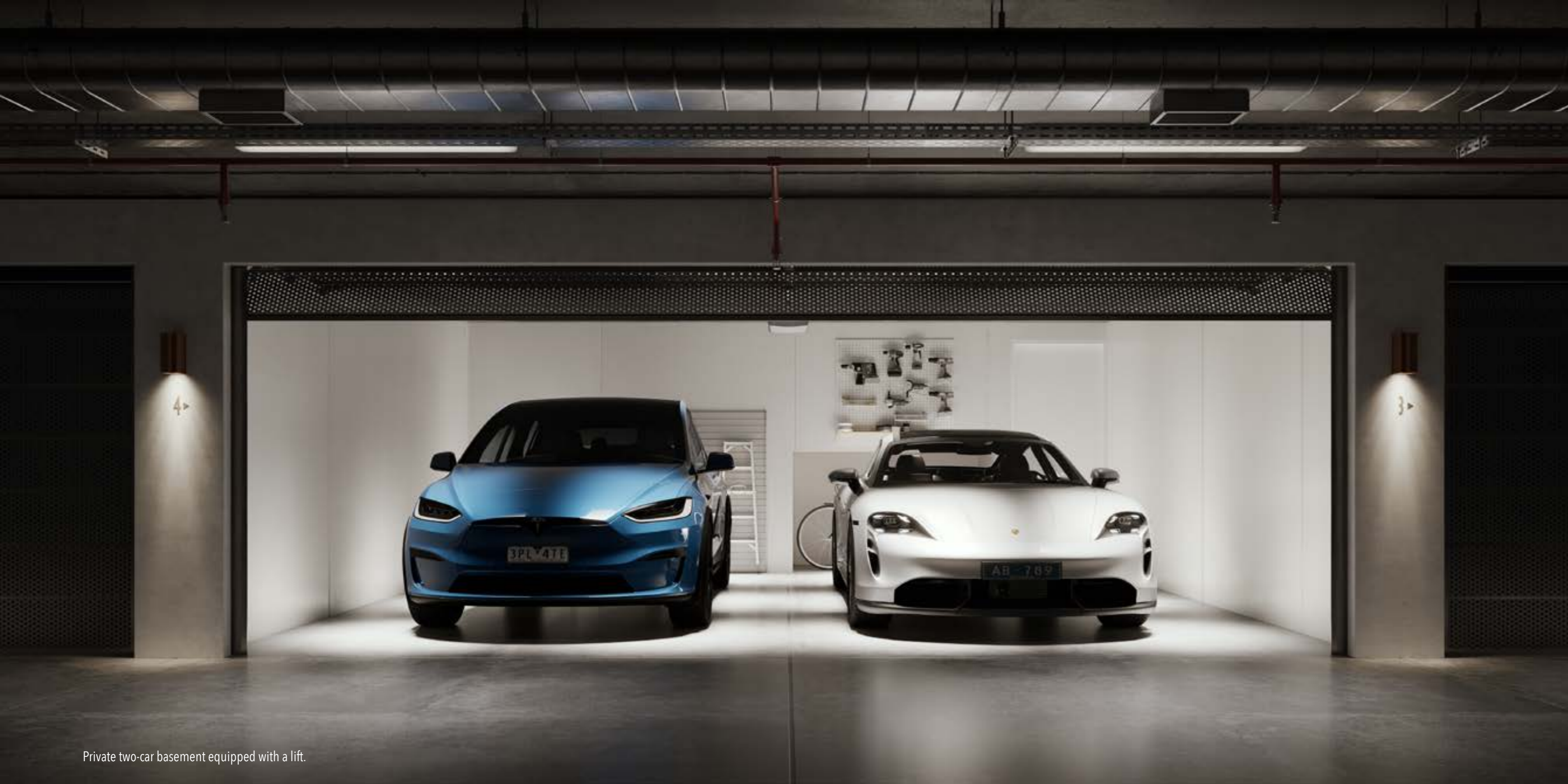
Private two-car basement equipped with a lift.

THE BASEMENT GRANTS RESIDENTS EXCLUSIVE ENTRY TO THEIR OWN SECURE AND PRIVATE OVERSIZED DOUBLE GARAGE.