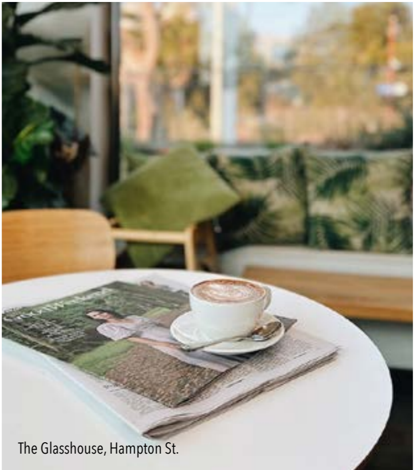
The Glasshouse, Hampton St.

Conveniently situated at the end of your street, you'll find some of Hampton's finest cafes like Glasshouse and Paperboy, known for their excellent coffee, delicious pastries, and breakfast menus. As you venture further, Hampton Street beckons with a diverse range of cuisines, ensuring you're spoiled for choice. Among the many culinary treasures lies La Svolta, a renowned Italian restaurant that captures the essence of authentic flavours. Whether you're seeking a cozy morning coffee or relaxed dining experience, Hampton's expansive culinary scene is yours to enjoy.