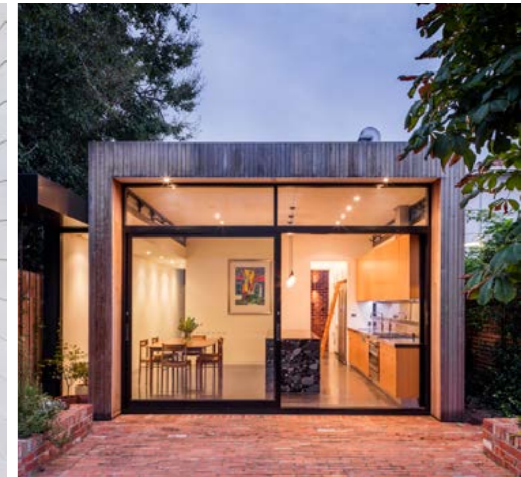
Balaclava home, 2015.