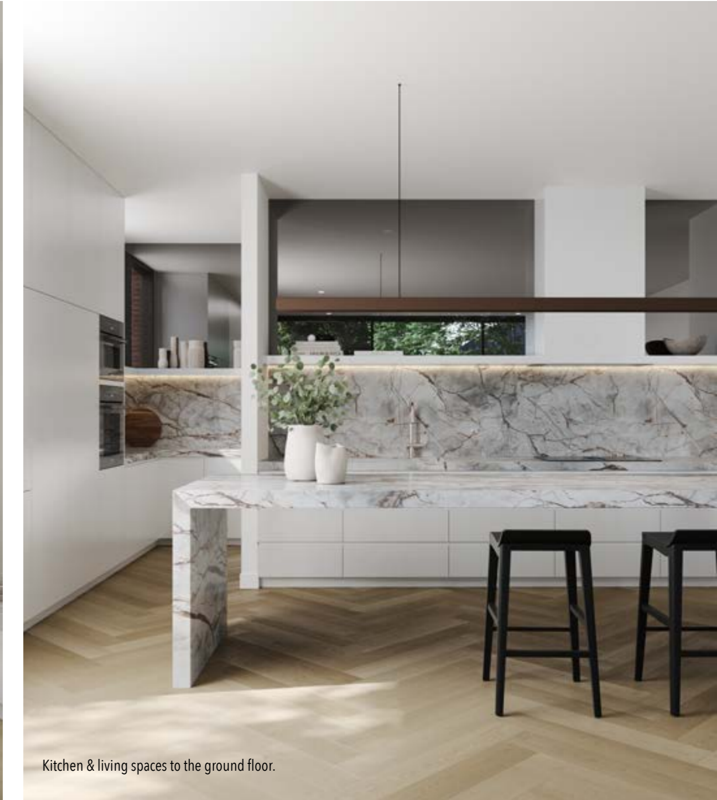
Kitchen & living spaces to the ground floor.