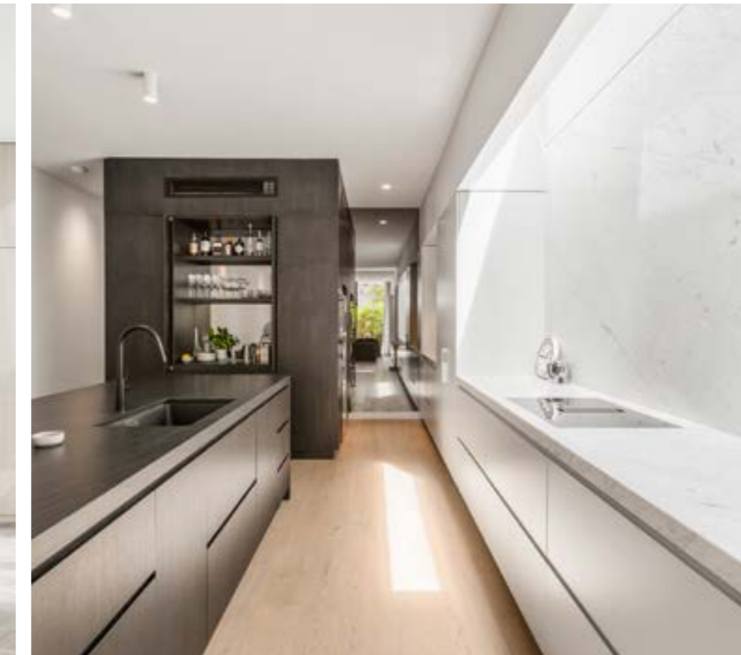
Windsor townhomes, 2021.