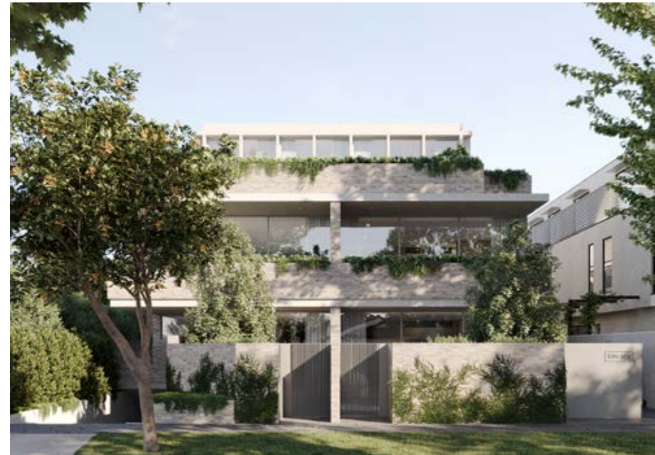
Middle Brighton apartments, 2023.