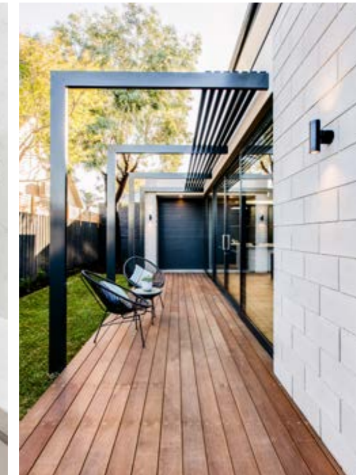
Cheltenham townhouses, 2018.