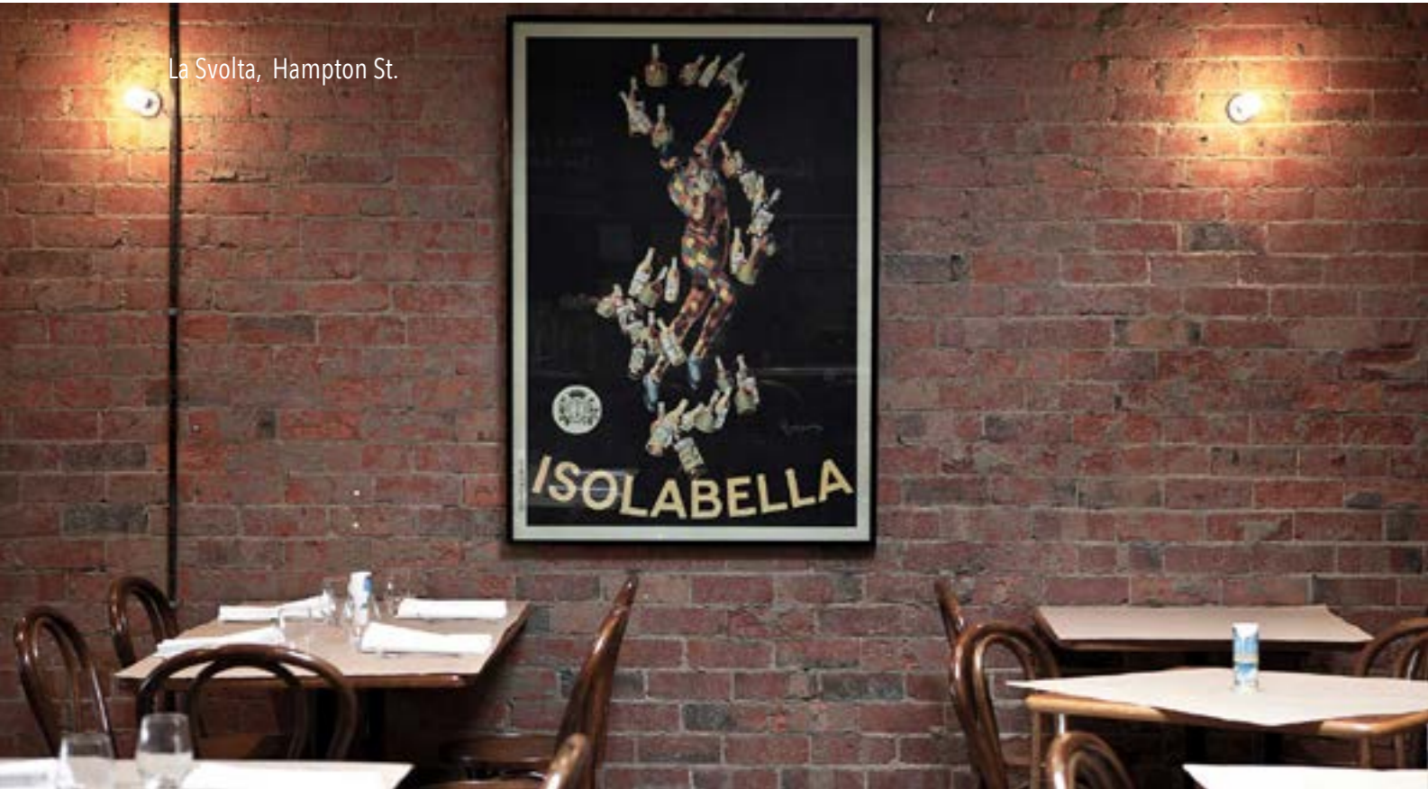
La Svolta, Hampton St.

HAMPTON'S VIBRANT LIFESTYLE WHOLEHEARTEDLY EMBRACES THE LOVE FOR GOOD FOOD AND COFFEE, WITH AN IMPRESSIVE SELECTION OF CAFES, RESTAURANTS, AND BARS TO EXPLORE.