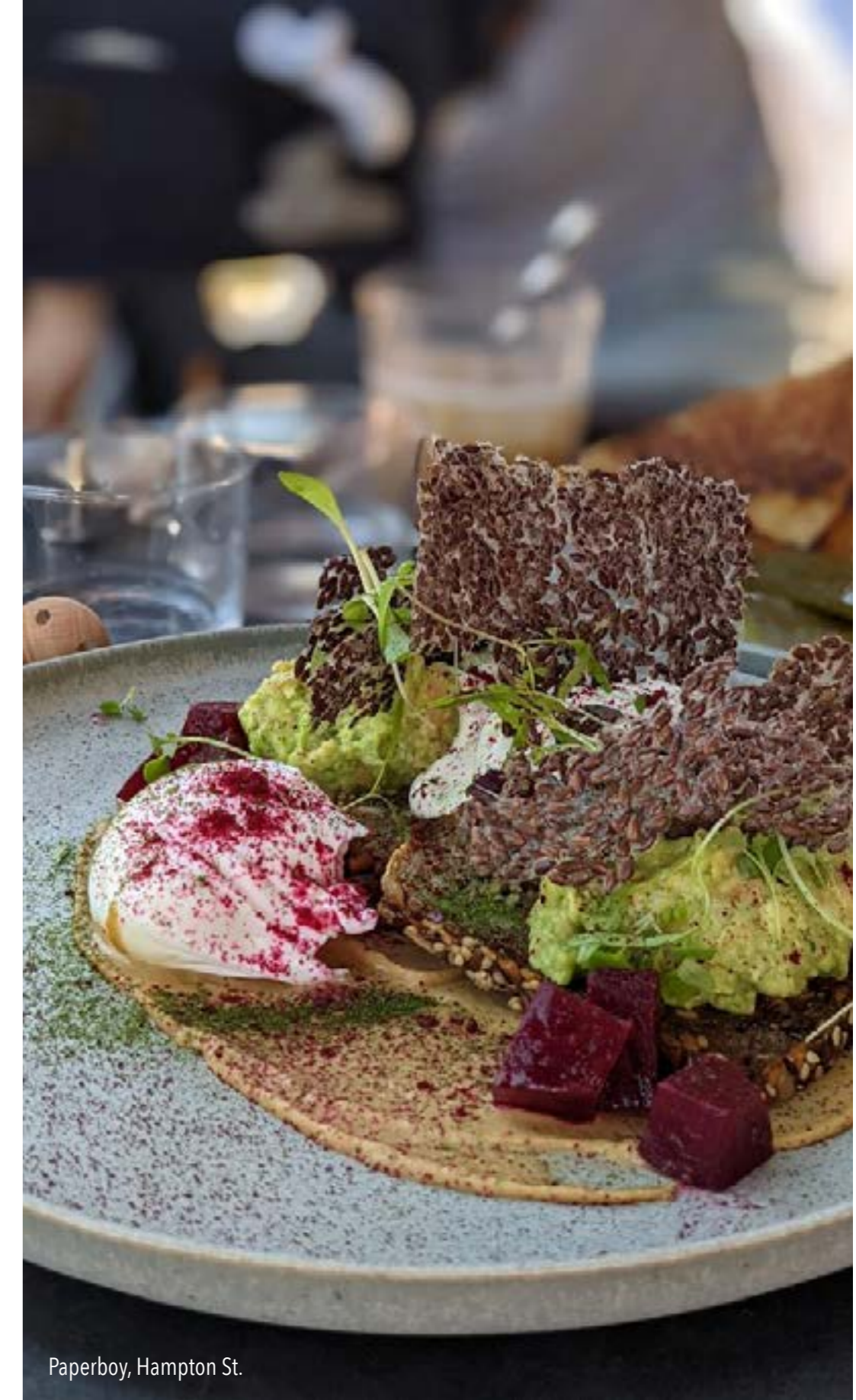
Paperboy, Hampton St.