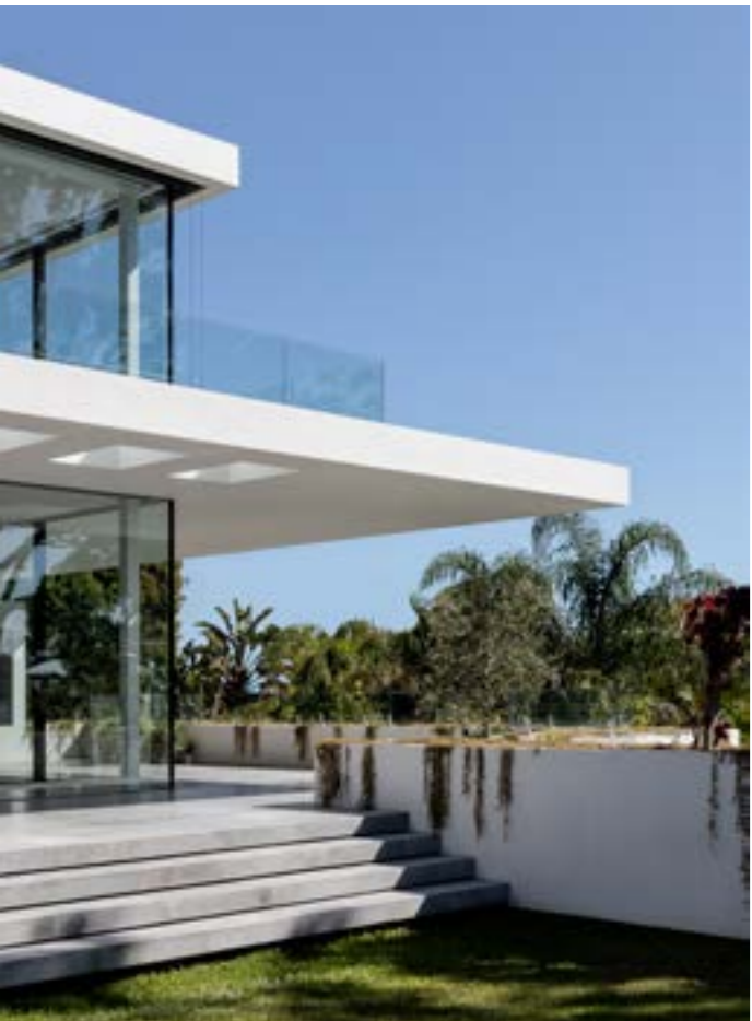
Hampton home, 2020.