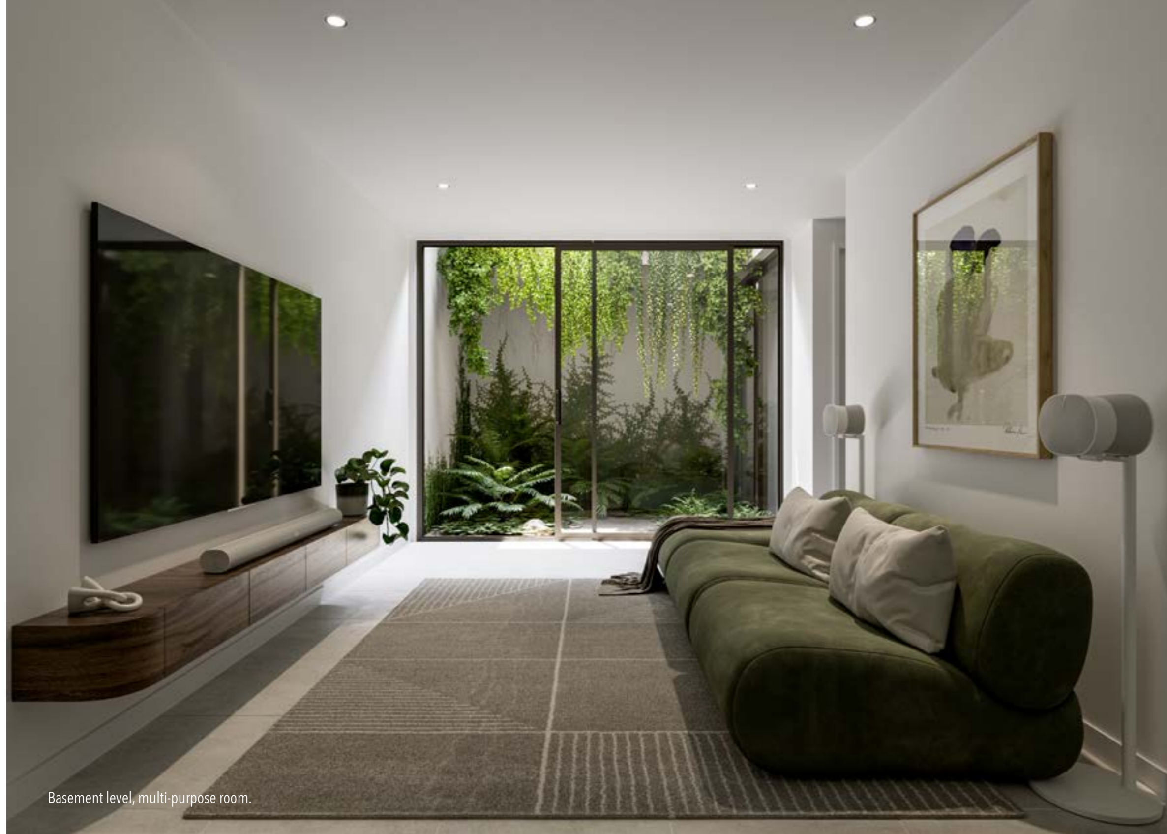
Basement level, multi-purpose room.

LIVING SPACES CAN BE CUSTOMISED ACCORDING TO INDIVIDUAL PREFERENCES, GRACED WITH NATURAL LIGHT VIA THOUGHTFULLY POSITIONED LIGHT WELLS & COURTYARDS.