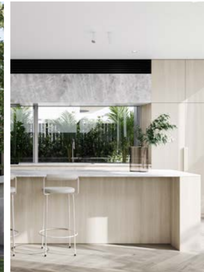
Middle Brighton: residence kitchen.