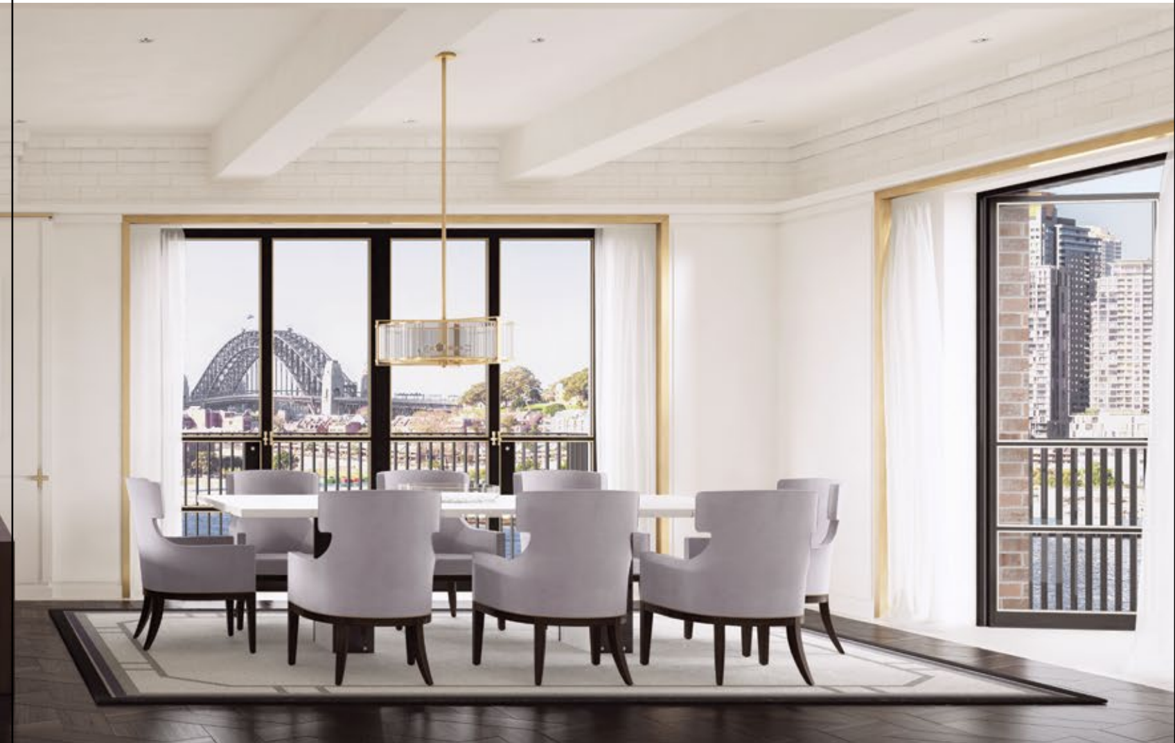
As with every apartment, the penthouse spans the building's full width, its north-facing windows granting sunshine throughout the day.