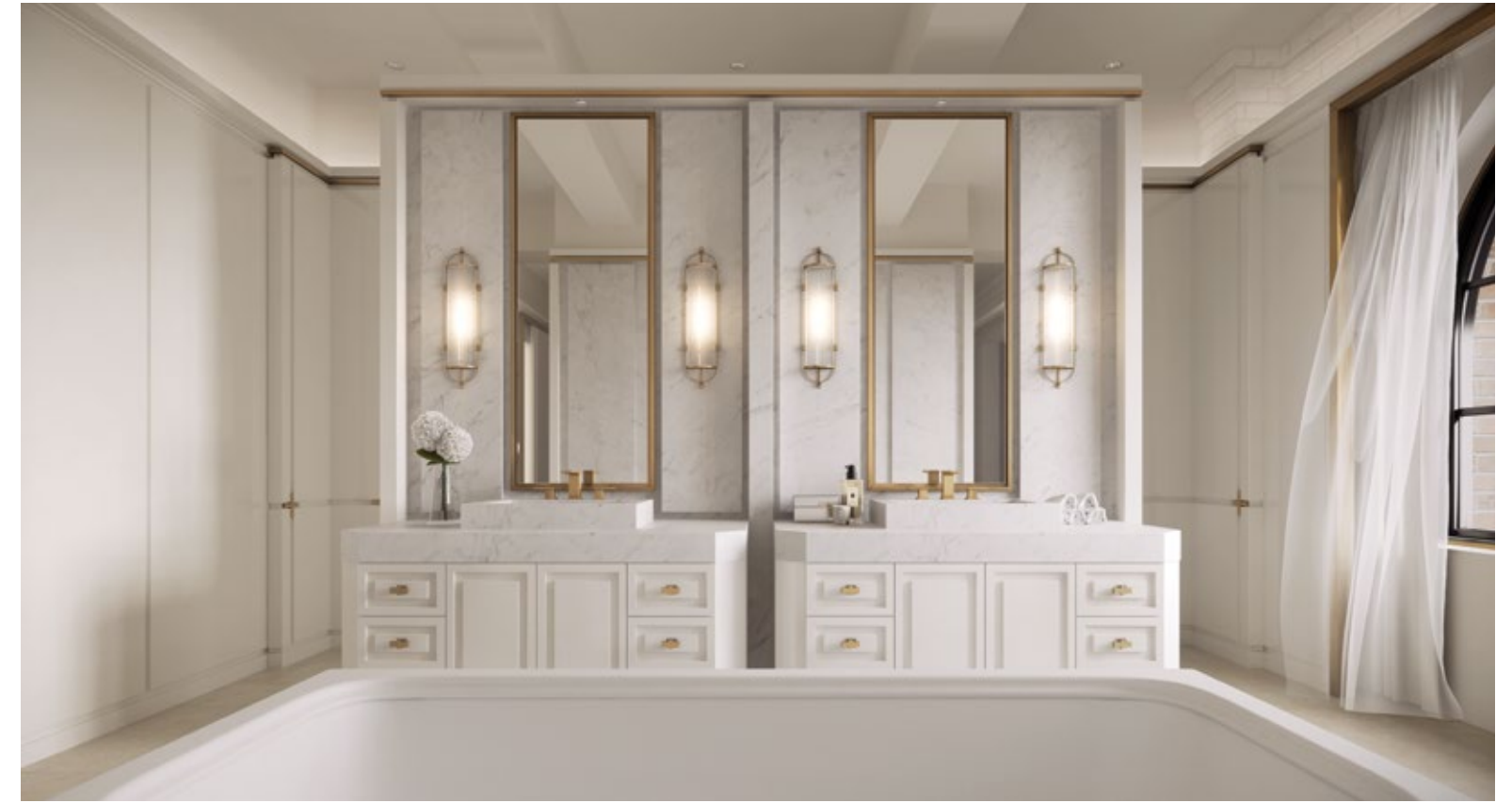
The penthouse en suite, luxuriously appointed with marble his-and-hers vanities, echoes the overall design concept with its bronze detailing. As in the kitchen, the arched window is a feature.

With its singular blend of rich heritage, spectacular location and sheer quality of design concept, The Revy offers something other contemporary residences cannot match.