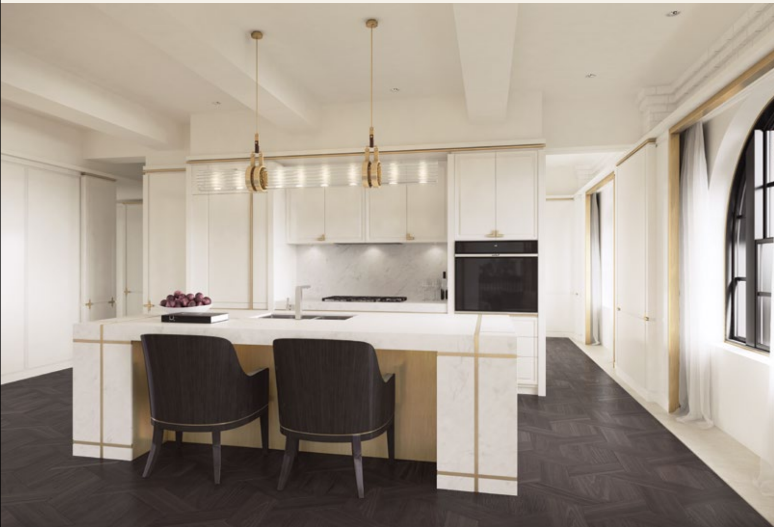
The signature light is custom designed to pair with the elegant marble countertop whose bronze detailing recalls the wall panels. Fitted with chef-quality Sub-Zero and Wolf appliances, this superb kitchen also makes a feature of the distinctive arched window, day and night.