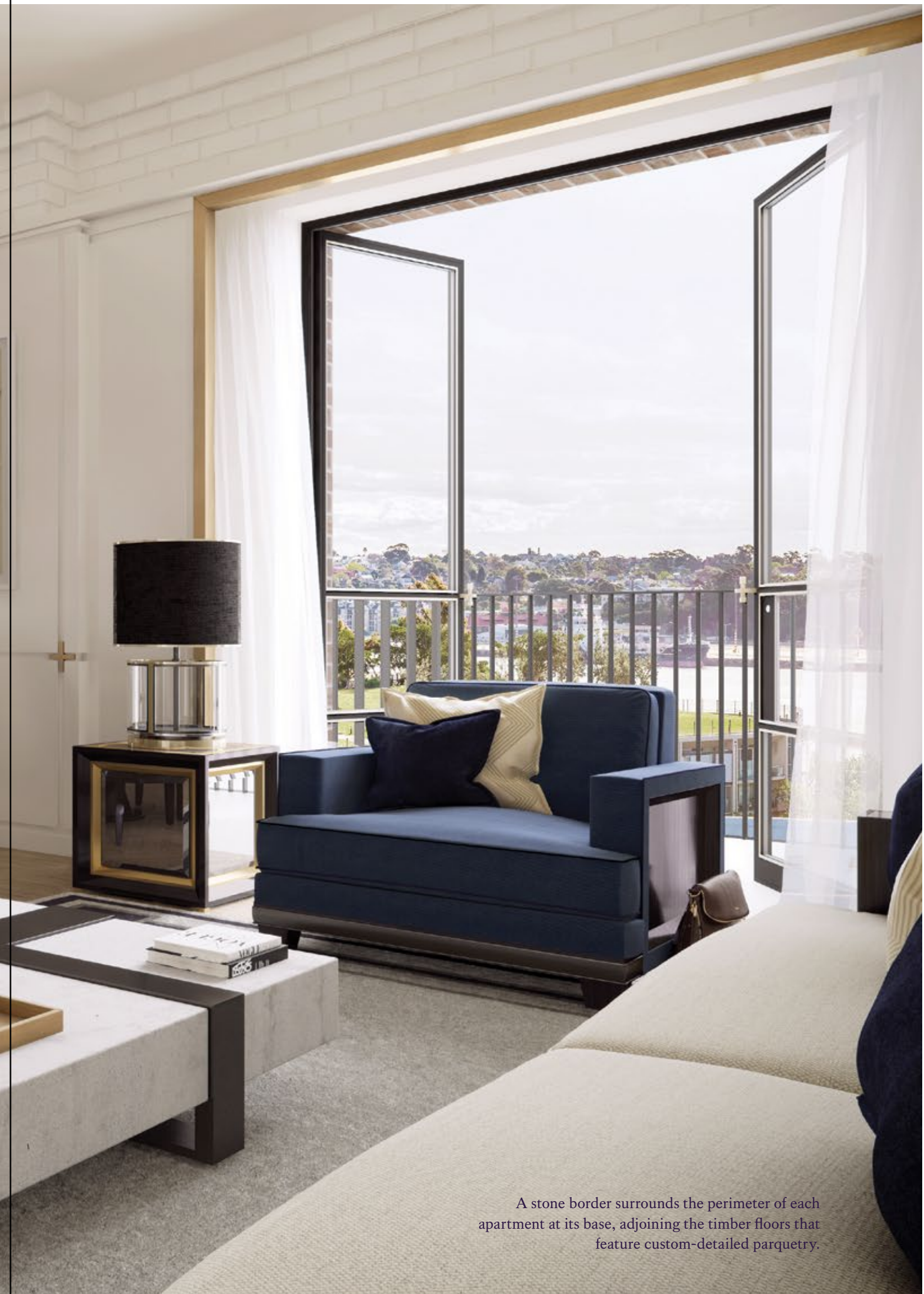
A stone border surrounds the perimeter of each apartment at its base, adjoining the timber floors that feature custom-detailed parquetry.