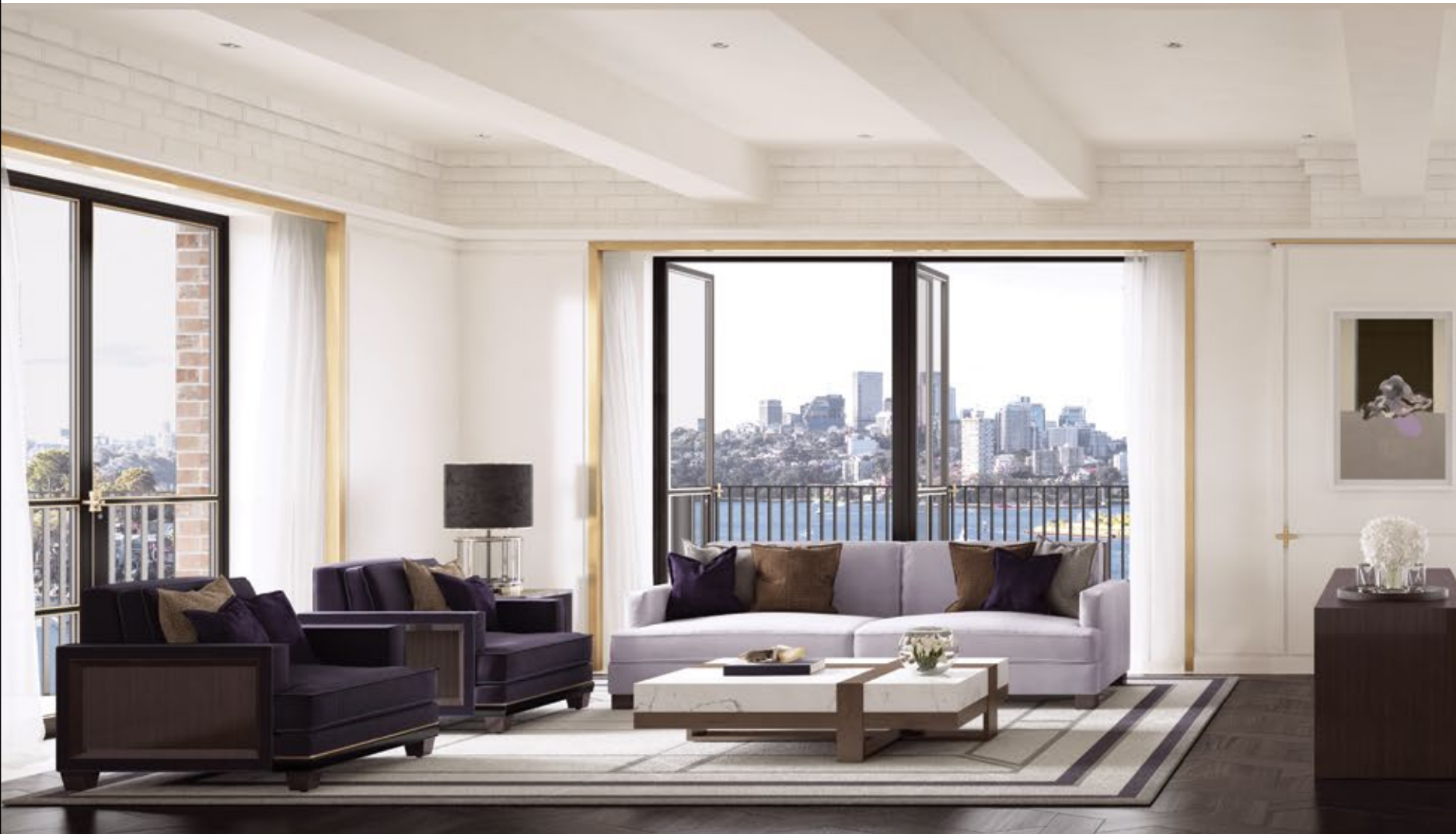
Drapery slides discreetly behind the wall panels, while subtle cove lighting highlights the original brickwork above. Bronze detailing frames the spectacular views.