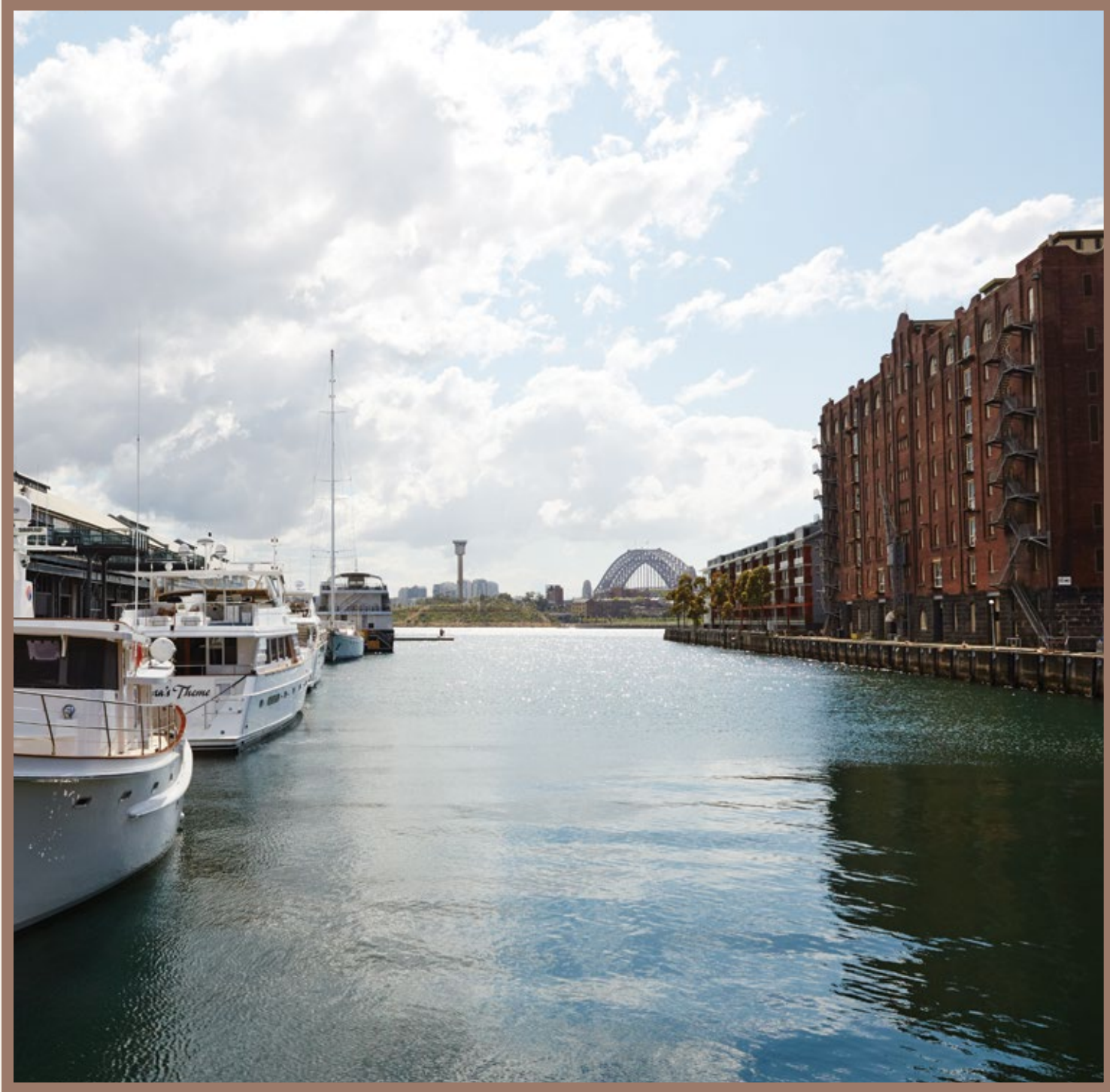
The Renvy is nestled on a promontory on Darling Island, overlooking its own wharf running along Jones Bay