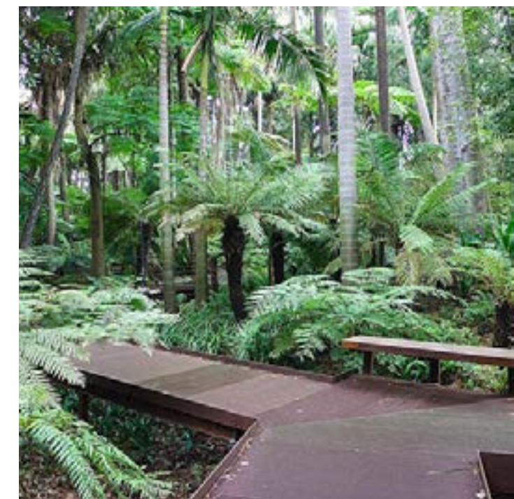
Royal Botanic Gardens Melbourne Enjoy a rejuvenating encounter with nature by exploring the Royal Botanic Gardens Melbourne. Spread across 38 hectares, over 8,500 plant species from across the globe are experienced through tours, activities or just a peaceful stroll. Meanwhile, the Tan Track's gravel trail provides an excellent running spot.