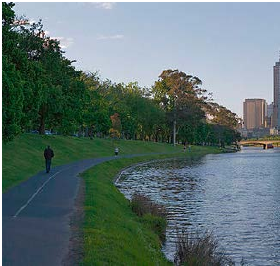
Main Yarra Trail The Main Yarra Trail awaits just down Bridge Road. Accessible via Richmond Park, where the historic Hawthorn Bridge crosses the Yarra River, this vegetated path stretches around 38 kilometres through the northeastern suburbs. Landmarks like the Fairfield Park Boathouse and Dights Falls provide fascinating stops along the way.