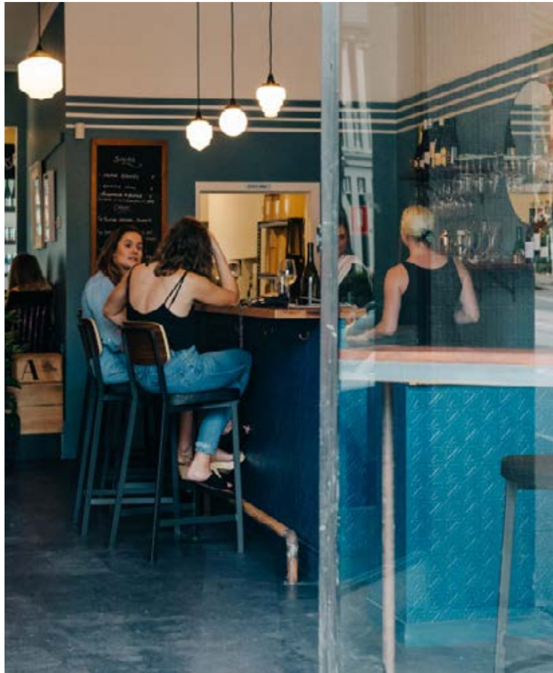
Atlas Vinifera Just around the corner from Berry Street, Atlas Vinifera is the go-to spot for local vino aficionados. Guests browse a monthly hand-picked list of 24 wines served by the glass alongside charcuterie, cheese and antipasto. The store also stocks over 400 bottles for those purchasing something special for home.

Richmond's dining scene is on the up and up, as a vast collection of high-end eateries and laid-back wine bars breathe new life into the neighbourhood. With several fresh ventures set alongside time-tested favourites, heading out for lunch or dinner is rarely so convenient and satisfying.