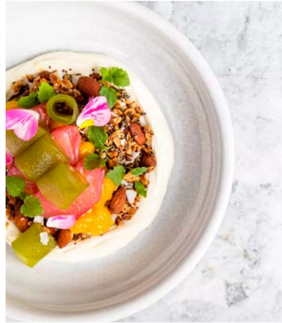
Top Paddock Top Paddock is often the choice brunch spot for Richmond residents. Specialising in paddock-to-plate dishes, the renowned cafe works with local makers and producers to achieve its seasonal philosophy. Despite its busy Church Street location, extensive natural light, textured timber and dense greenery transform this place into a lush haven.