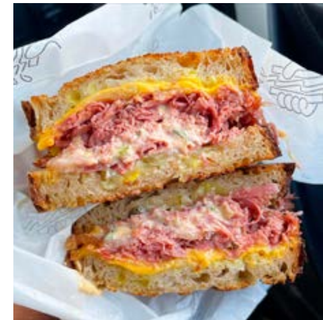
Hector's Deli Hector's Deli is a local favourite for lazy weekends. Tucked into a former milk bar, this much-loved eatery is famed for its delightfully simple yet undeniably tasty range of fresh and toasted sandwiches. Across classics like tuna melt, crumbed chicken, and roast pork, this low-key hangout always hits the mark.