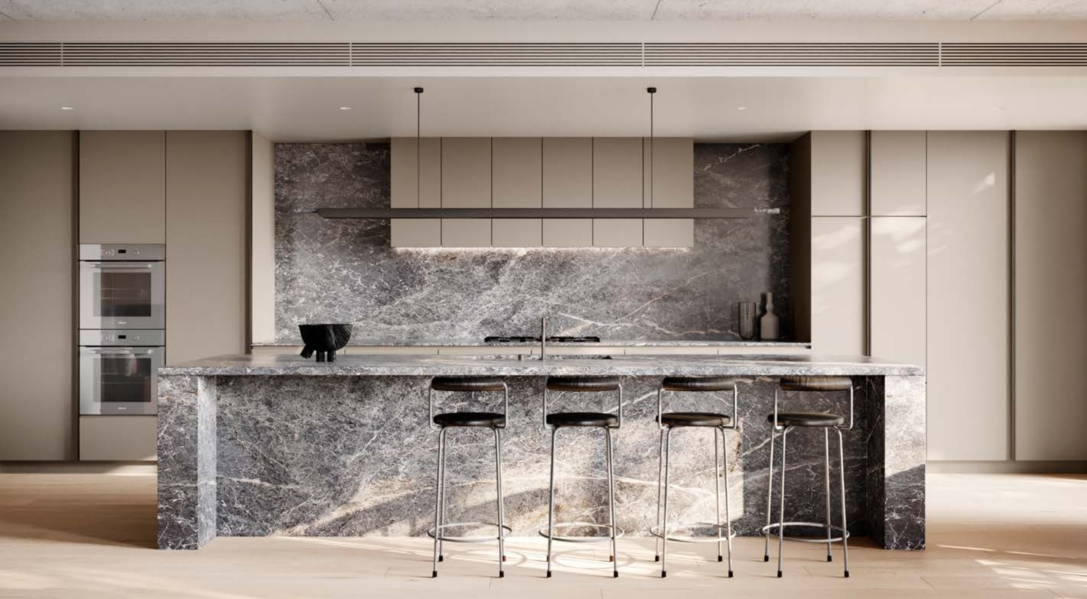
Dark natural stone & modern grey joinery combination