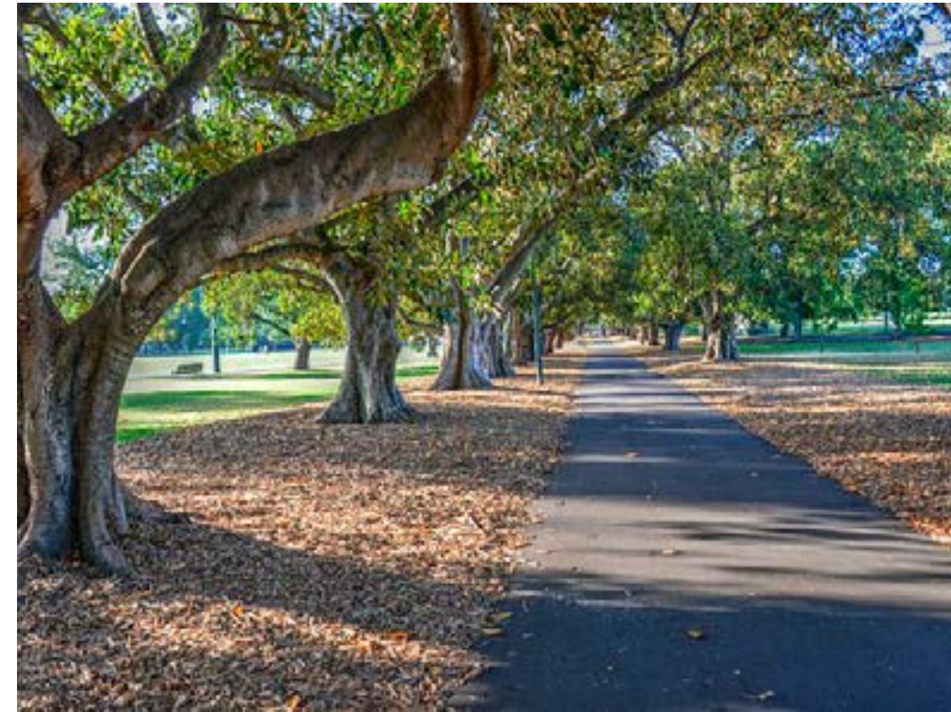
Yarra Park Home to iconic stadia like the Melbourne Cricket Ground and Punt Road Oval, Yarra Park is one of the inner city's most bustling green spaces. Yet outside of match time, this vast landscape remains relatively quiet, with convenient pedestrian bridges providing seamless access to Birrarung Marr and Federation Square.

For those who live an active lifestyle, Richmond and its surrounding areas offer an abundance of destinations perfect for an invigorating run, swim or pedal. With many of these settings bursting with idyllic nature, there are few better neighbourhoods to call home.