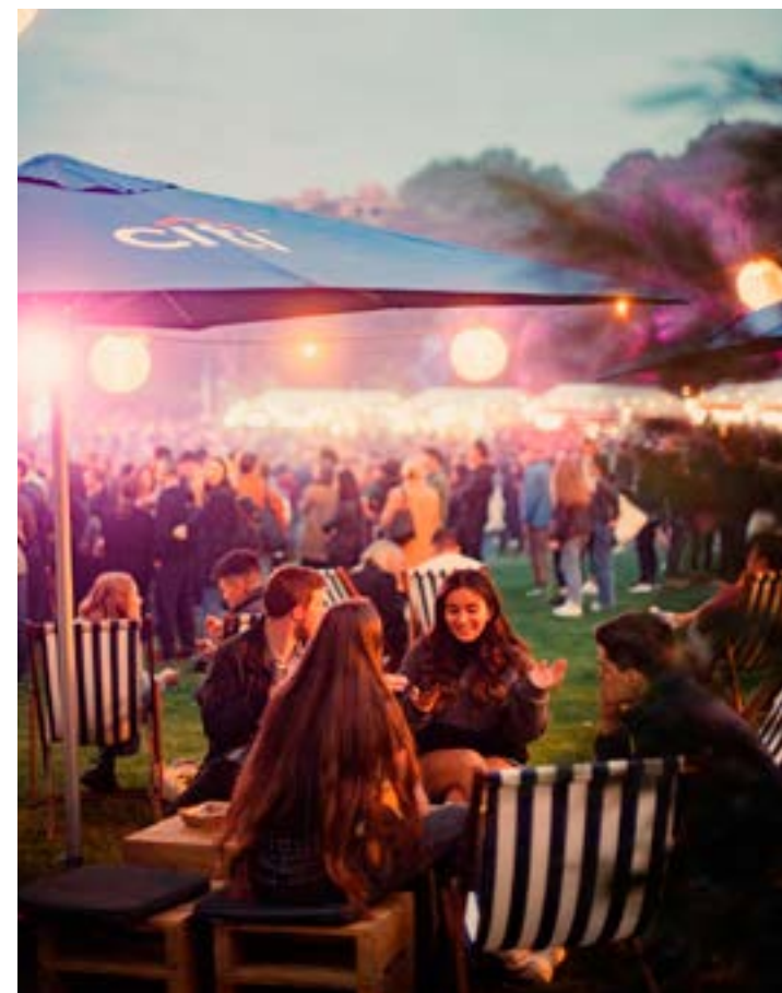
Birrarung Marr Perched on the edge of the CBD, Birrarung Marr is a thriving urban park that regularly hosts public events and community celebrations. Adorned with sculptures, audio installations and winding pathways that celebrate Melbourne's Indigenous culture, this inviting parkland makes for the ideal walking or cycling destination.