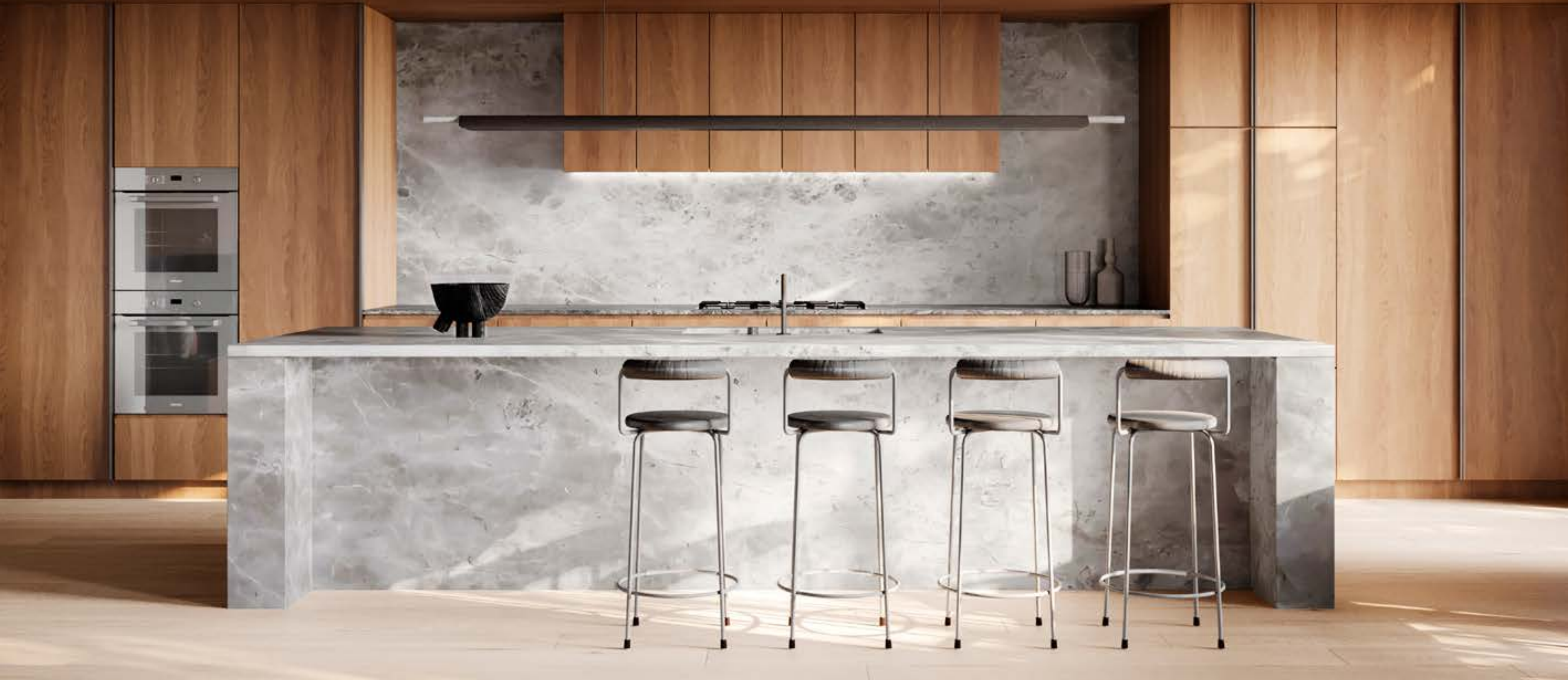
Light natural stone & timber look joinery combination