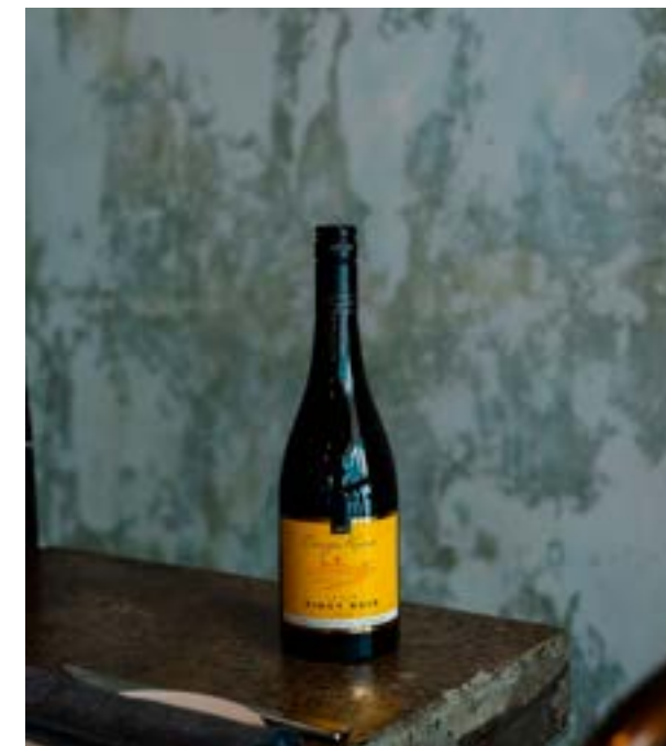
Ostër Ostër has received rave reviews from locals and critics alike since opening in 2019. With its Northern Italian roots resonating throughout, the restaurant champions hyperlocal growers through highly seasonal dishes. Along with a sustainable beverage offering, including house-distilled liquor and micro-wineries, Ostër's communal vibe is unmissable.