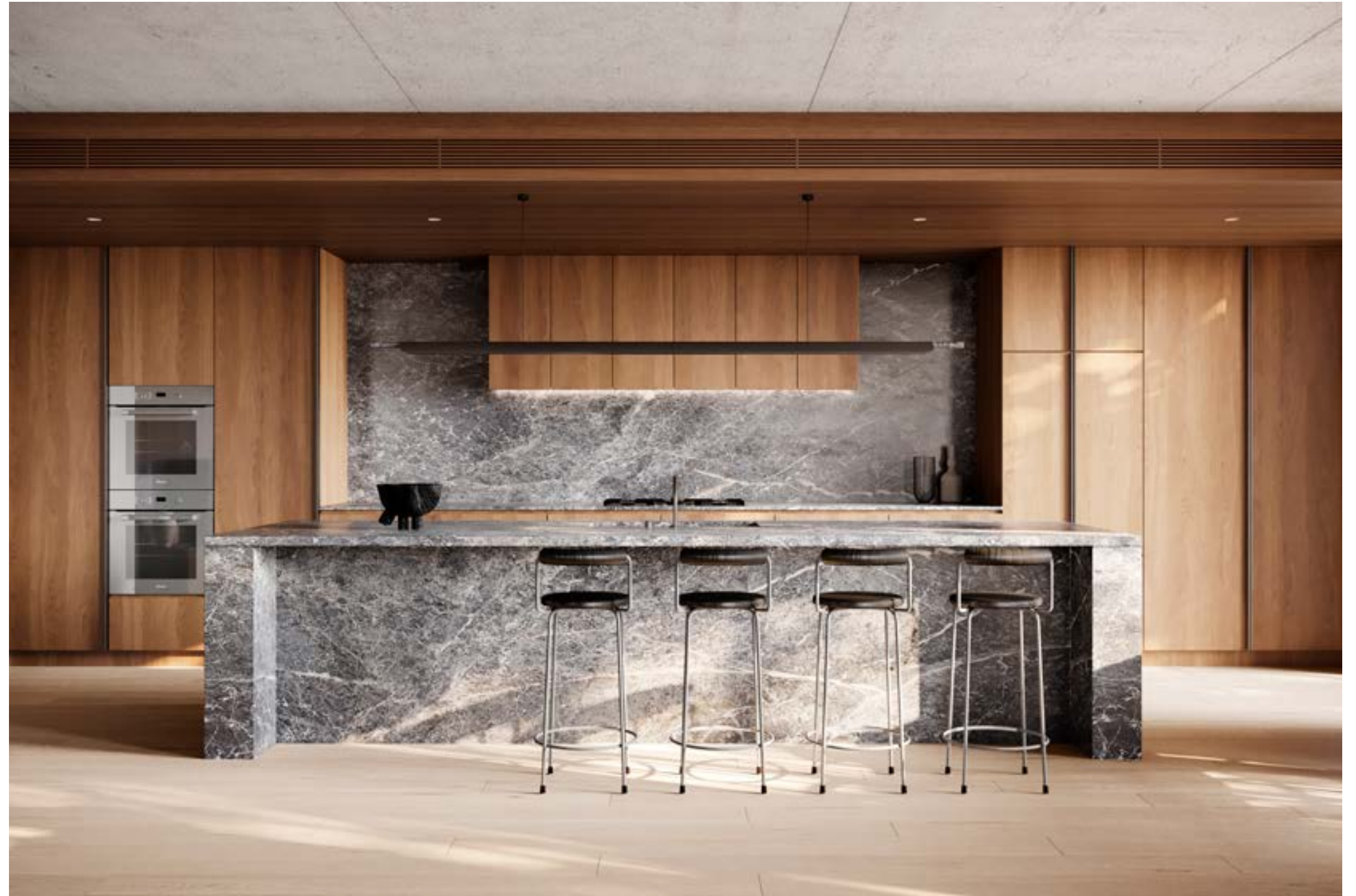
Dark natural stone & timber look joinery combination

From designer pendants to fluted glass features, fireplaces to integrated fridges, we will work with you to achieve your vision.