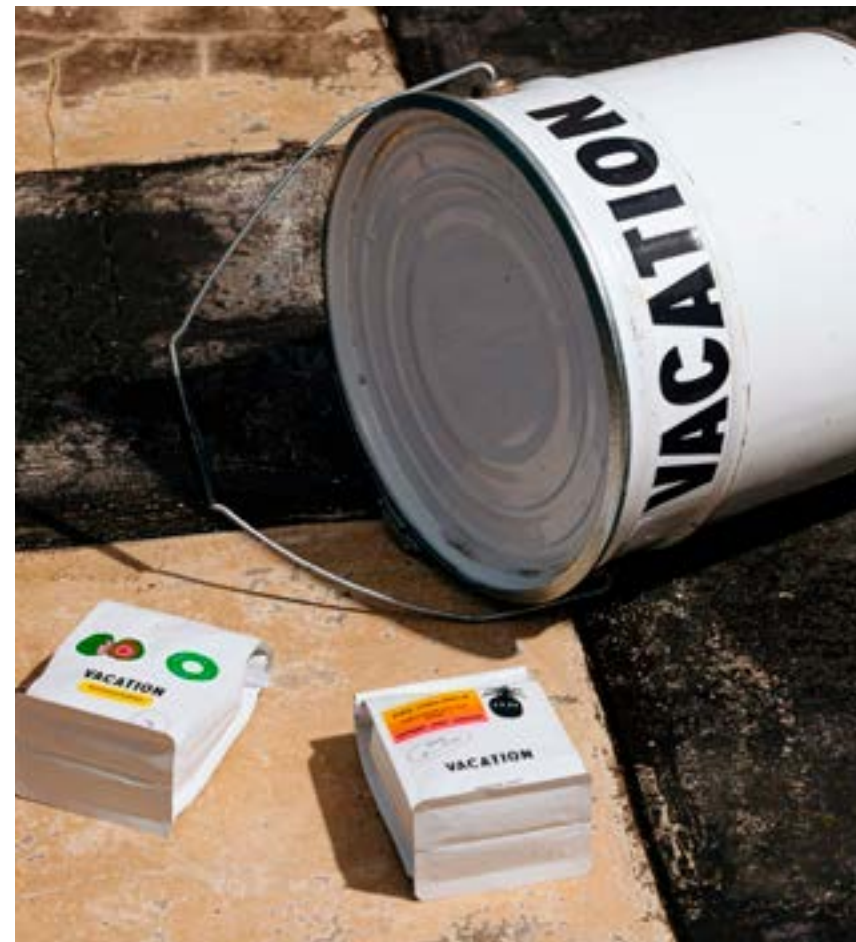
Vacation Situated in the backstreets of Cremorne, Vacation's main attraction is coffee. Across a selection of freshly roasted single-origin and blended varieties, this chic cafe's caffeinated beverages easily compete with Melbourne's best. To eat, a range of sweet pastries, hot toasties and fancy toast round out a flavourful brunch experience.

You don't have to get swept up in Richmond's hum when the weekend arrives. The local area offers a variety of easygoing encounters that ensure your time away from home leaves you feeling relaxed and ready for the days ahead. Plan a nonchalant weekend around these mellow venues.