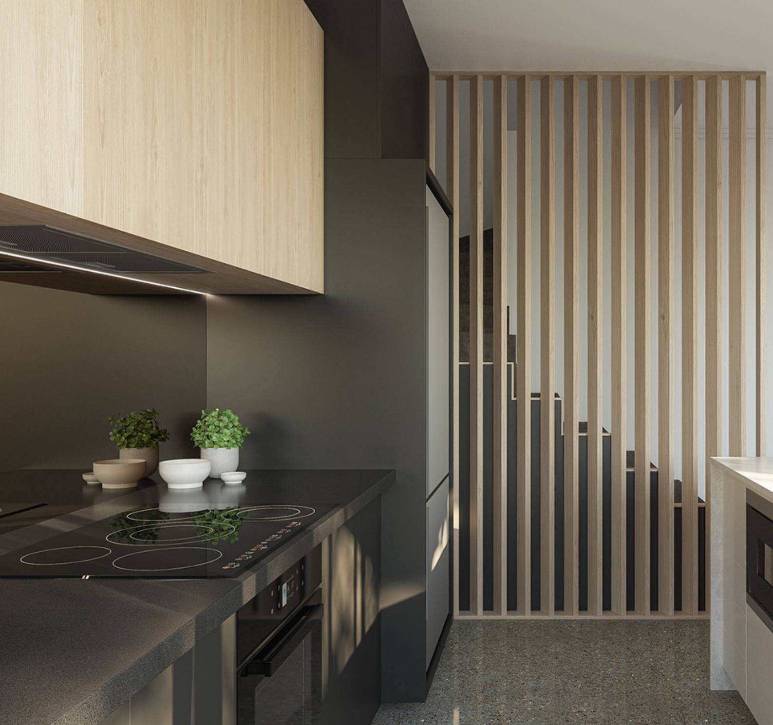
Artist Impression of Kitchen Areas