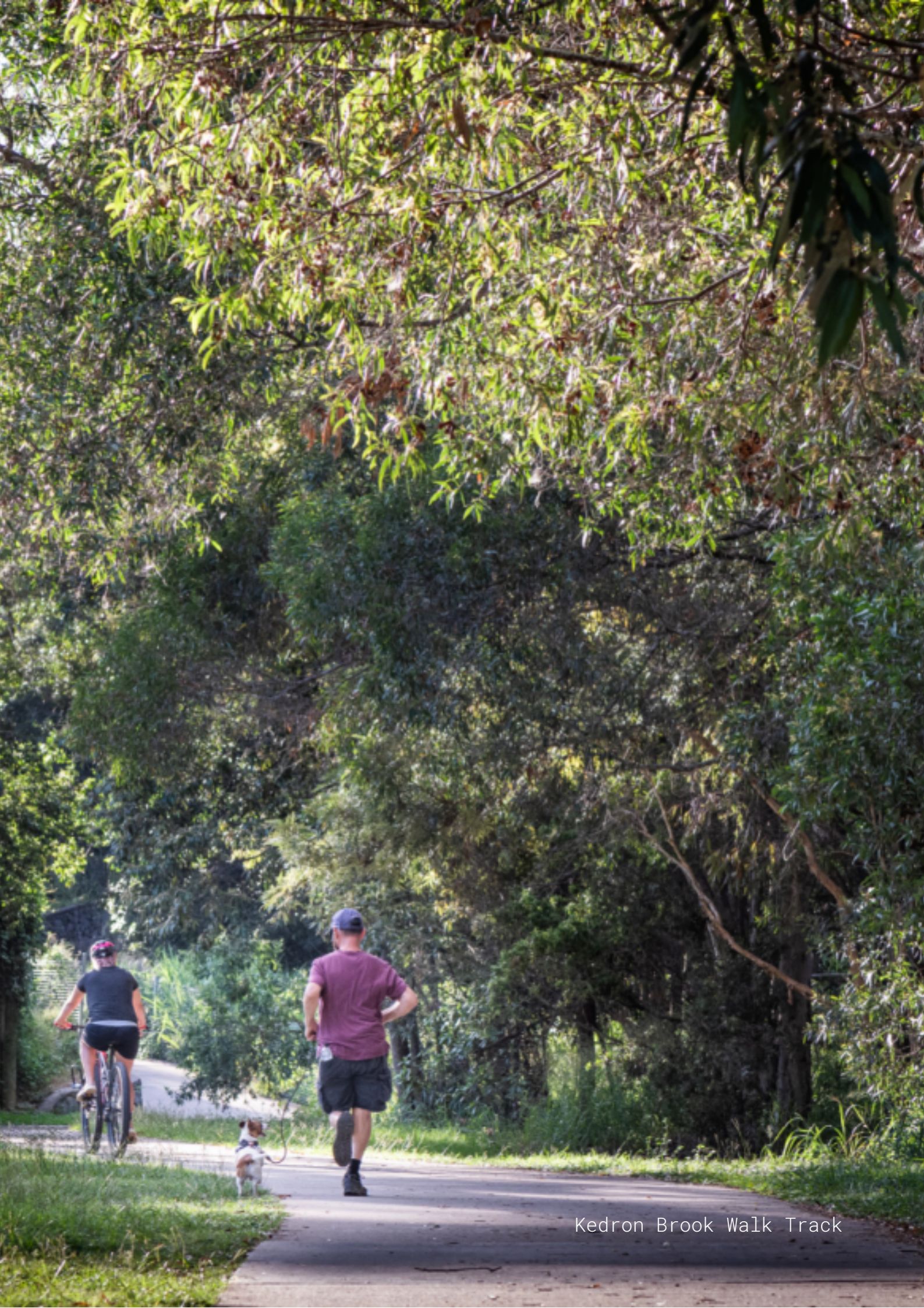
Kedron Brook Walk Track