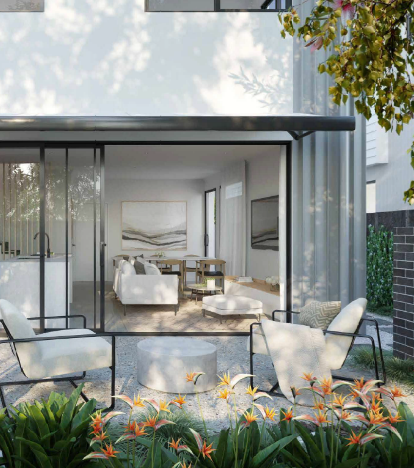
Artist Impression of Courtyard