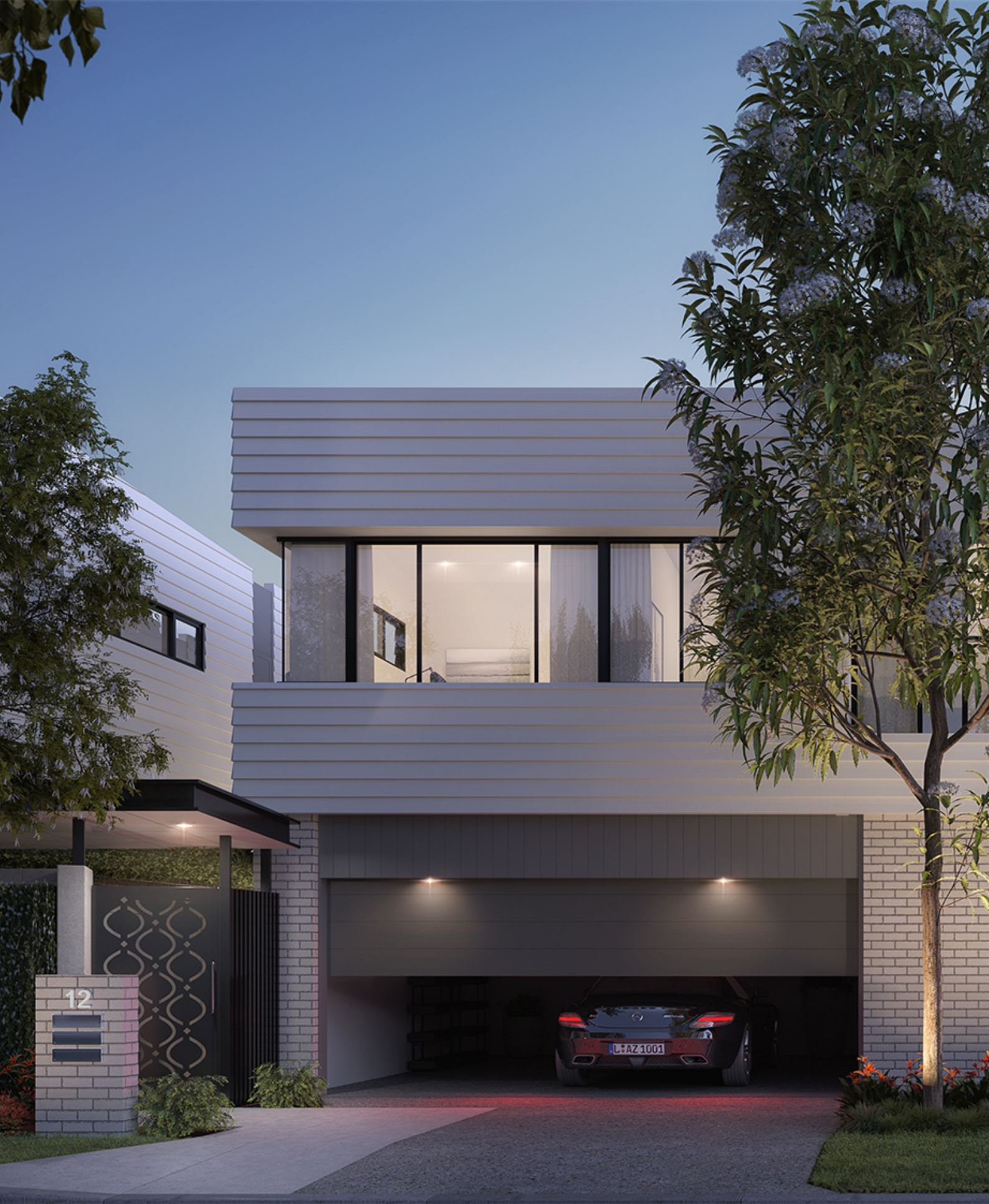
Terraces Artist Impression