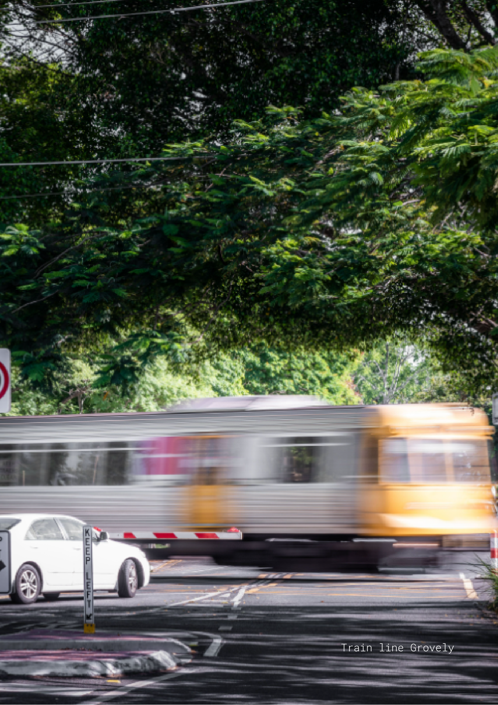
Train line Grovely