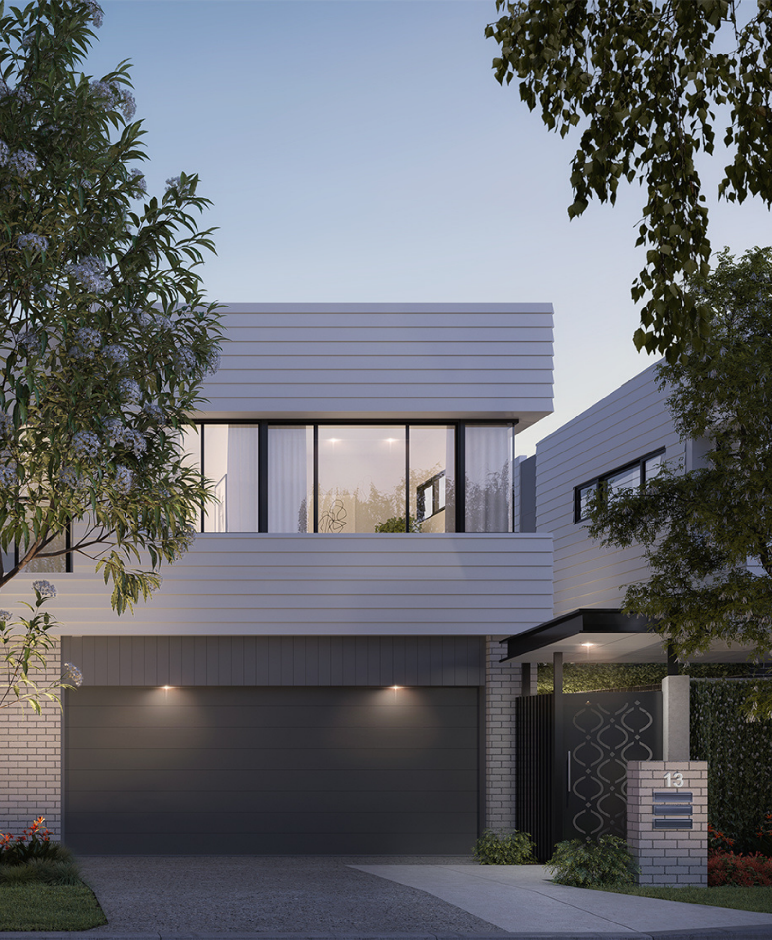
Terraces Artist Impression