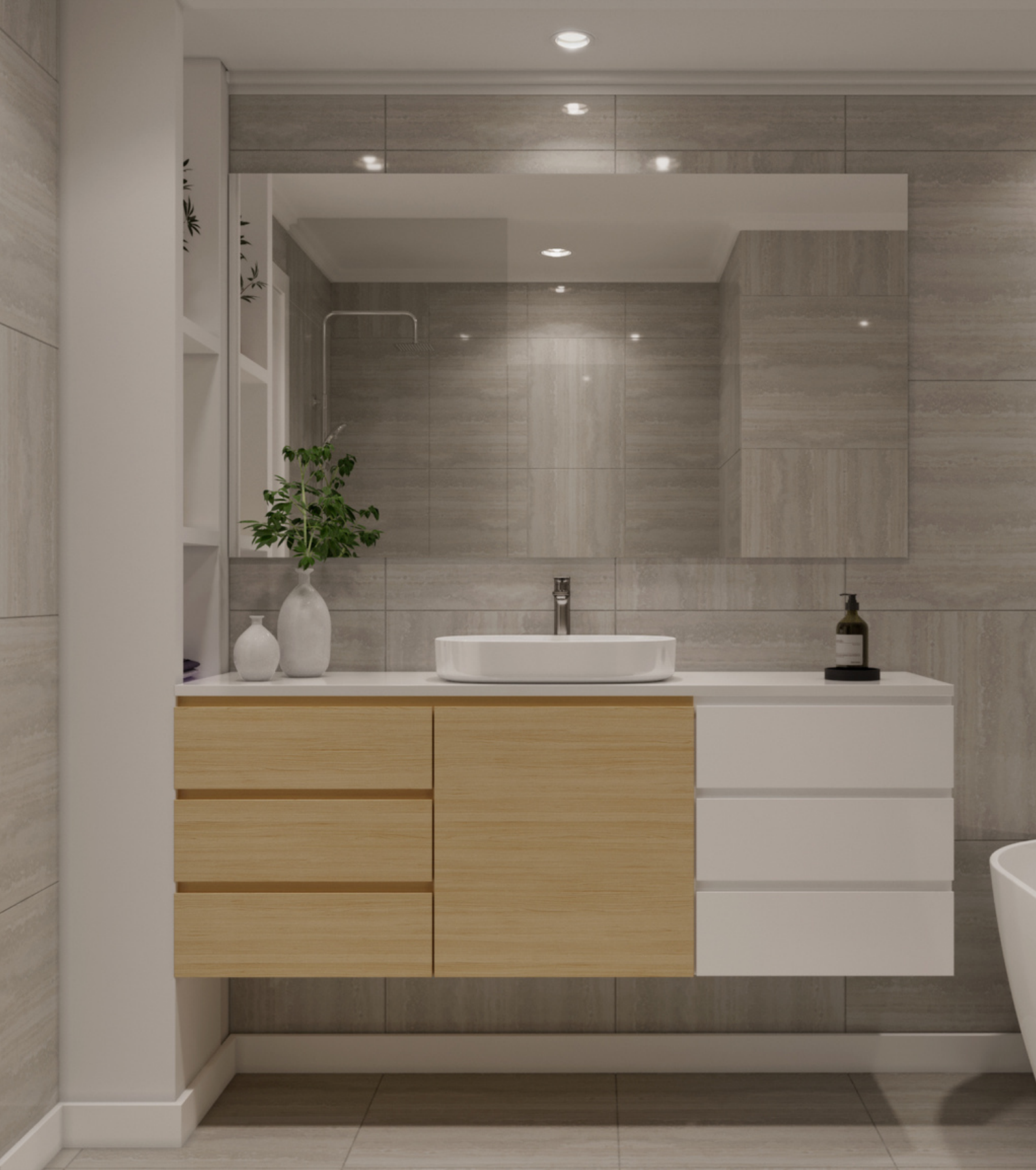
Artist Impression of Bathroom Areas