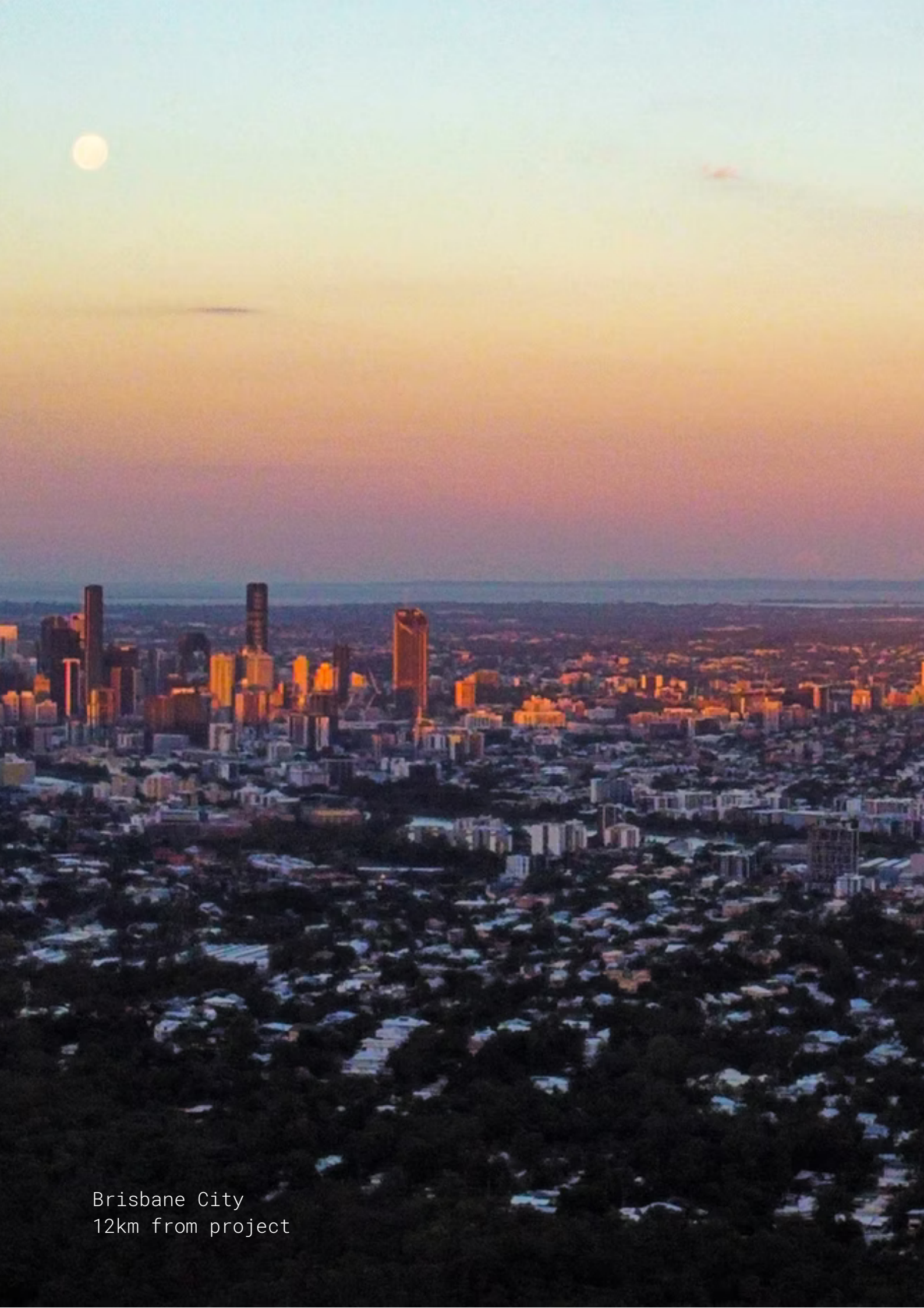
Brisbane City 12km from project