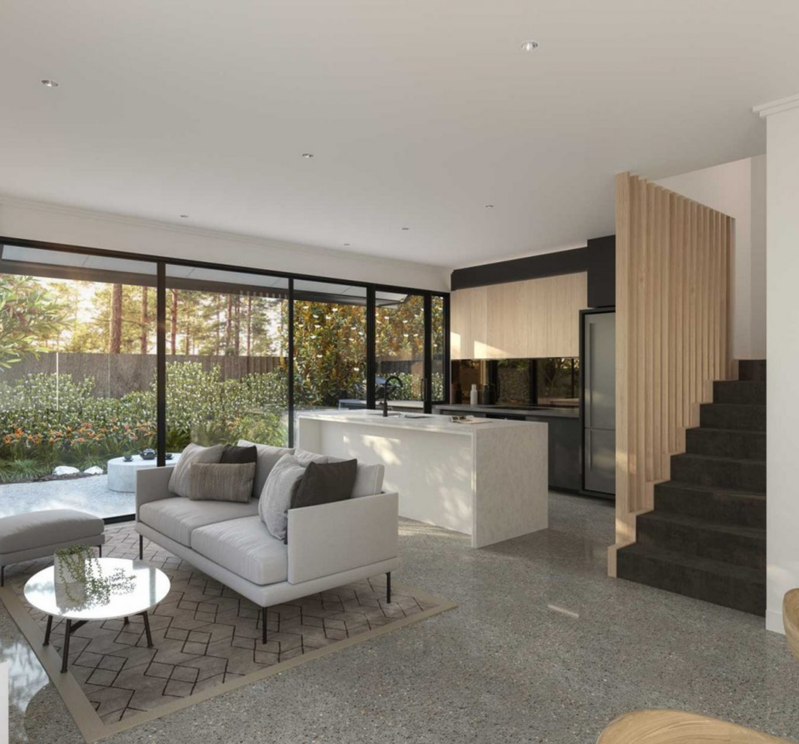
Artist Impression of Living and Kitchen Areas