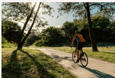
Kedron Brook Bikeway