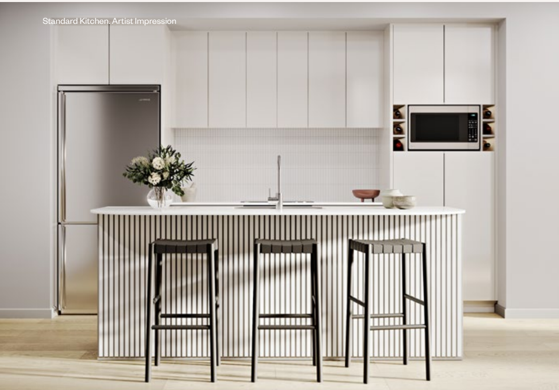
Standard Kitchen. Artist Impression