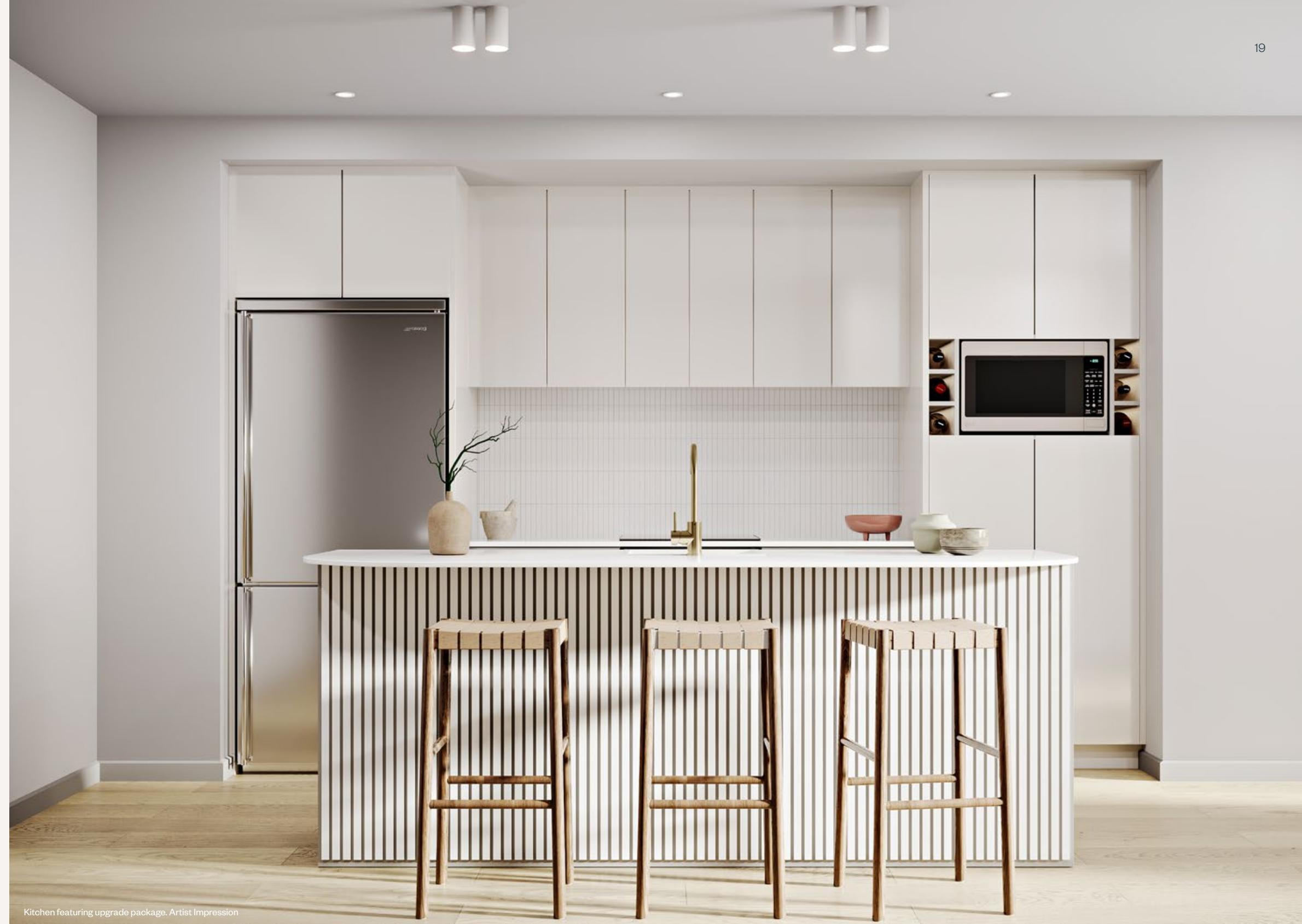
Kitchen featuring upgrade package. Artist Impression

Every element has been thoughtfully selected to create an ambiance that is both inviting and impressive, ensuring that your home is not just a place to live, but a work of art.