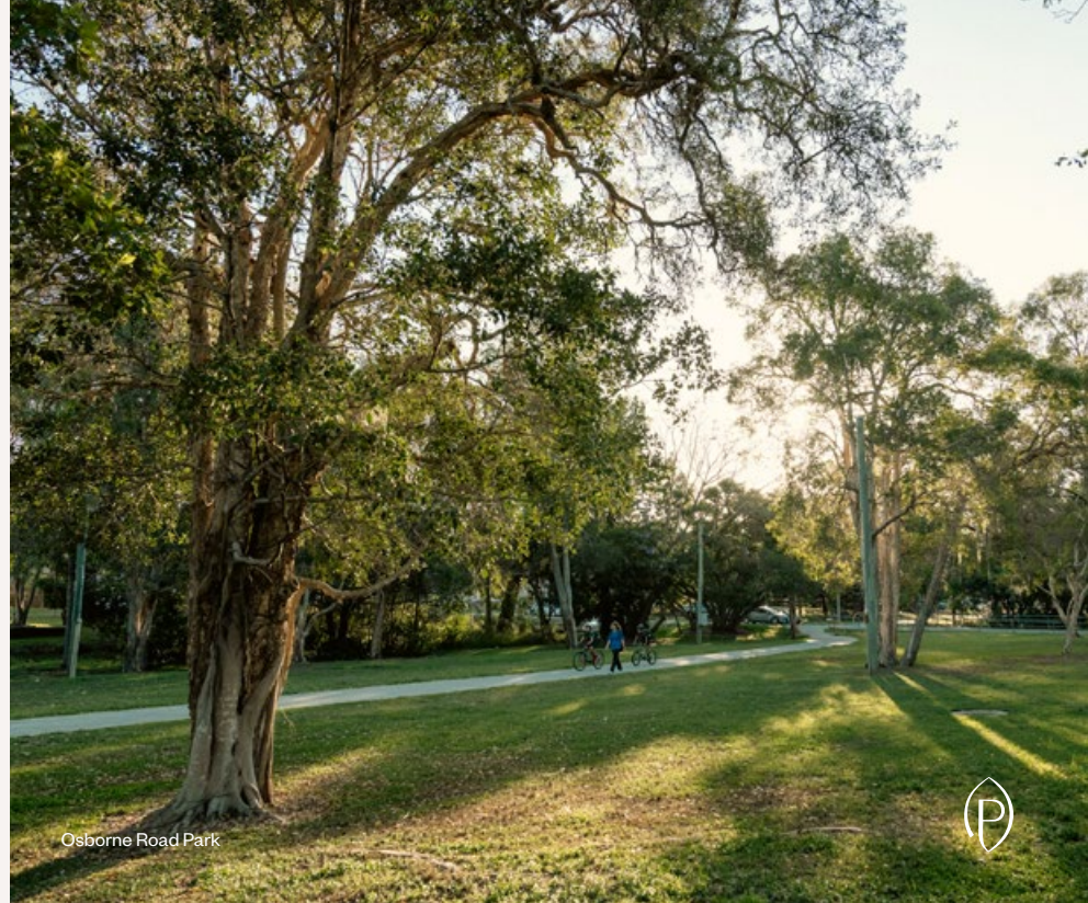
Osborne Road Park

Step into a realm where each detail resonates with style, crafting the perfect backdrop for your new lifestyle.