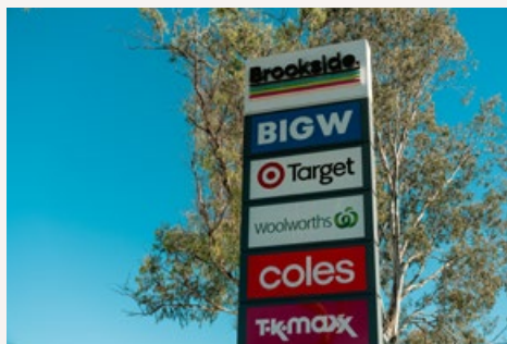
Brookside Shopping Centre