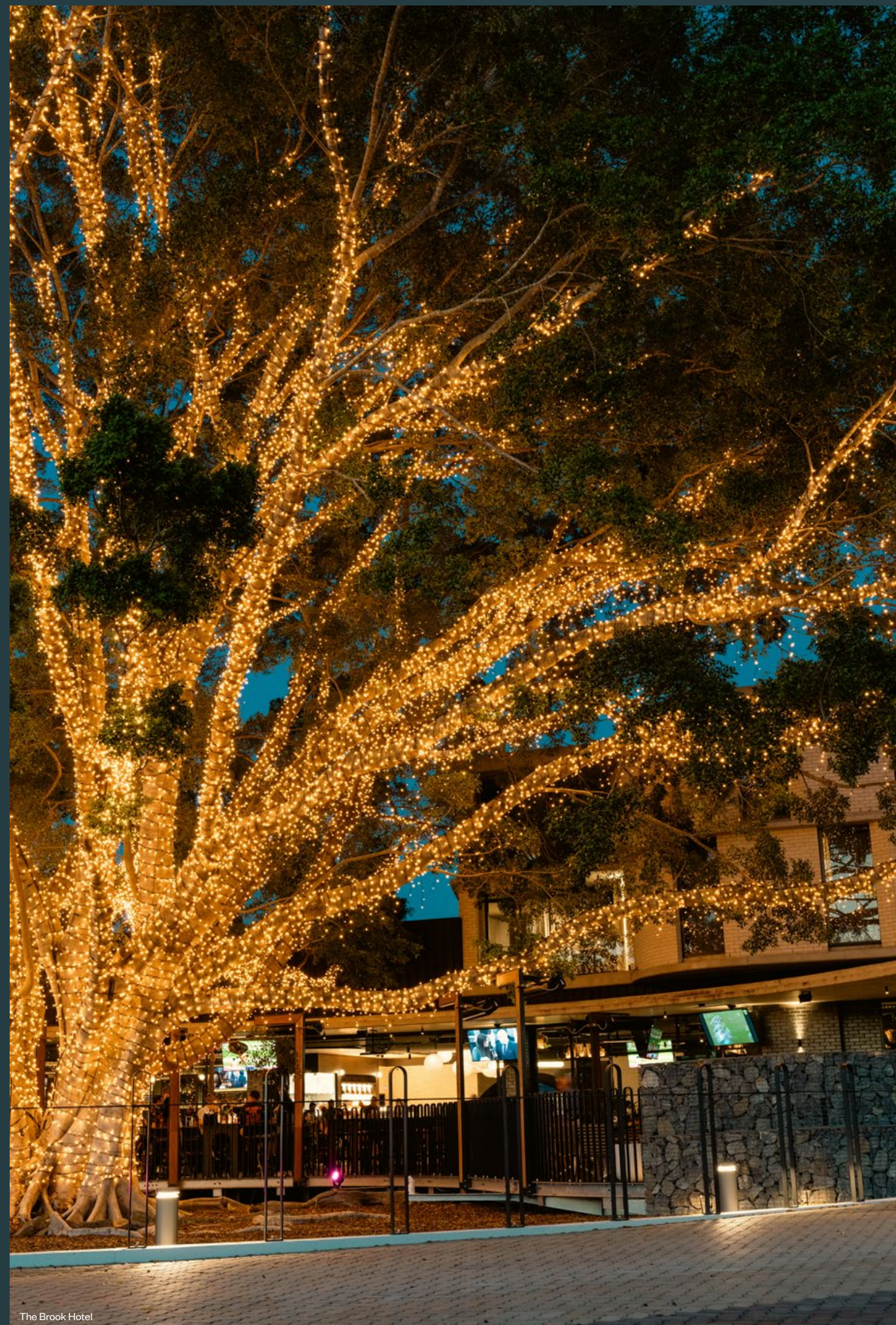
The Brook Hotel