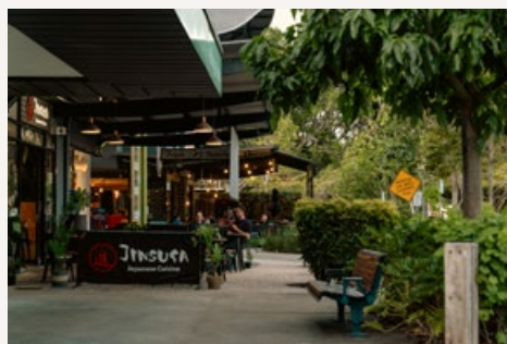
Blackwood Street Village