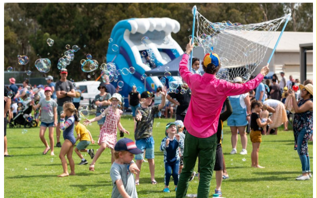
Bubbles and fun at the Huntly Family Fun Day

It was all bubbles, sunshine and lots of fun at the Huntly Family Fun day on Sunday 27 February. Fosterville Gold Mine was thrilled to be part of a very memorable day.